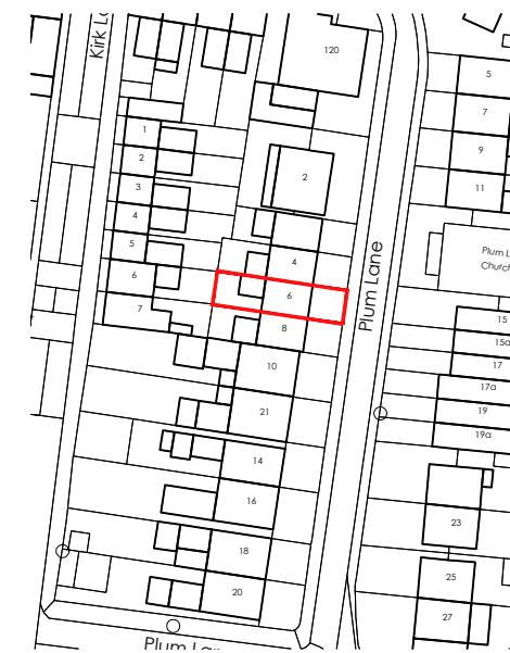
LOCATION PLAN SCALE 1:1250 @ A3

"(c) UKMap Copyright. The GeoInformation Group 2017 Licence No. LANDMLON100003121118"