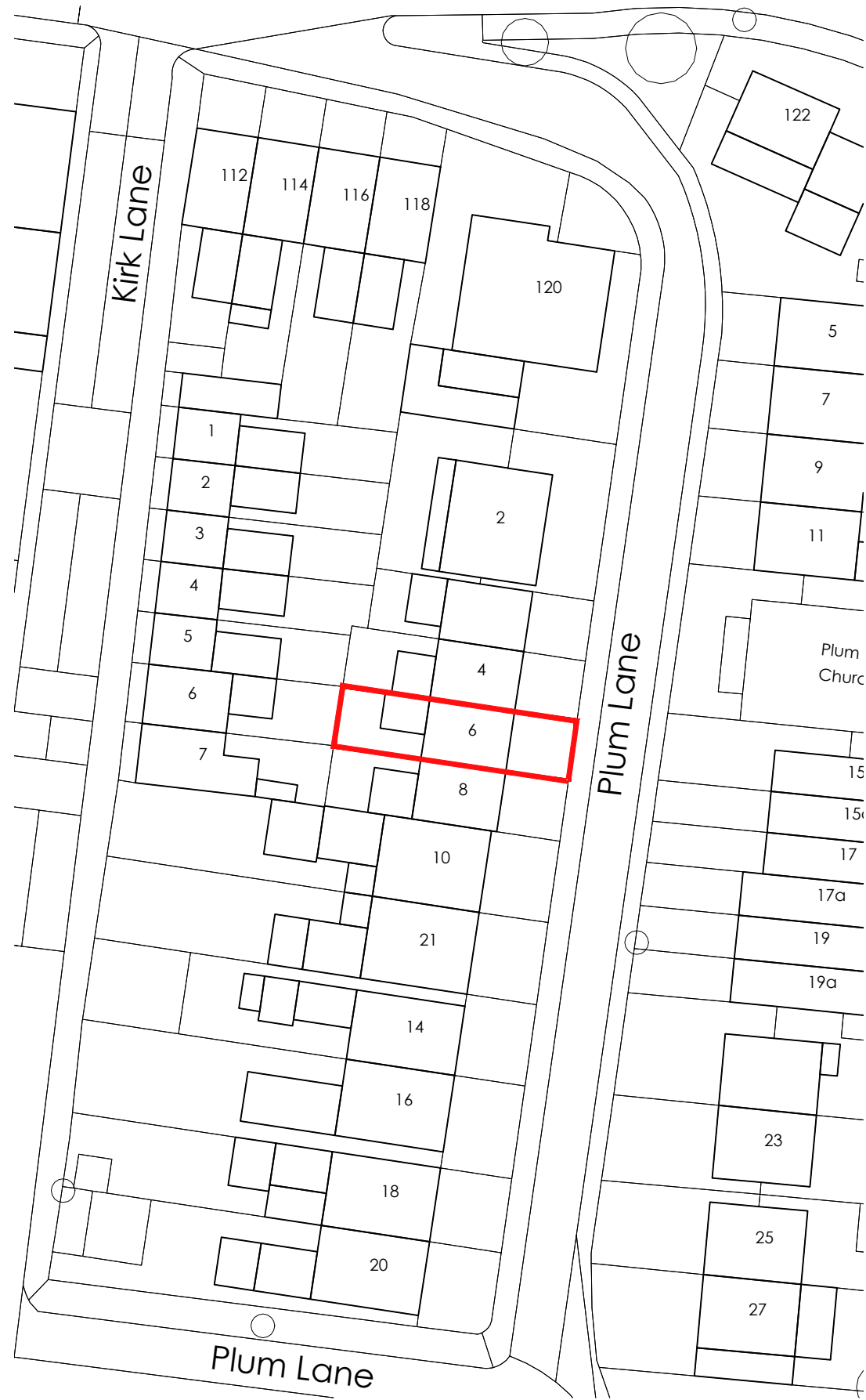
LOCATION PLAN SCALE 1:500 @ A3