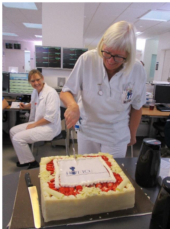
Randomisation number 1000 cake enjoyed in Kolding