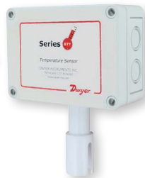
Outside Air without Radiation Shield