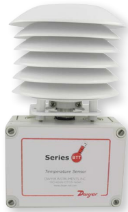
Outside Air with Radiation Shield