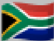
South Africa (no logo)