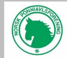
Norwegian Pony Studbook