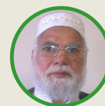
Abdur Rob Shahporan Masjid & Islamic Centre Trust