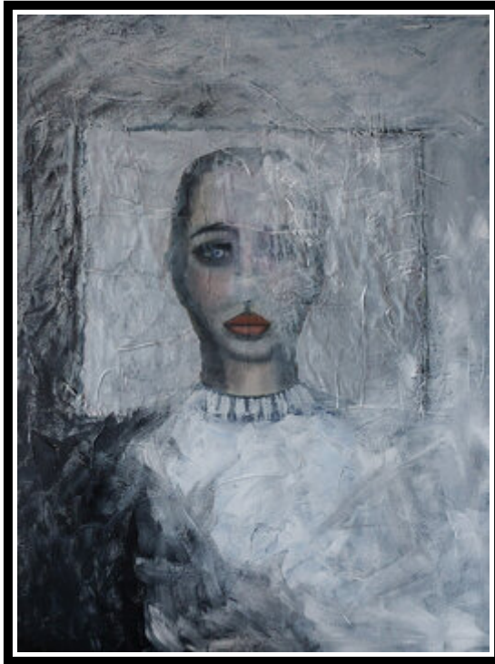
Clouds in my head