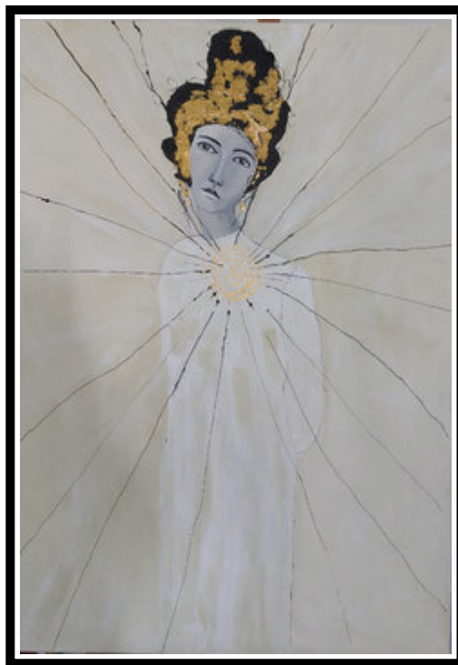
Healing of the heart