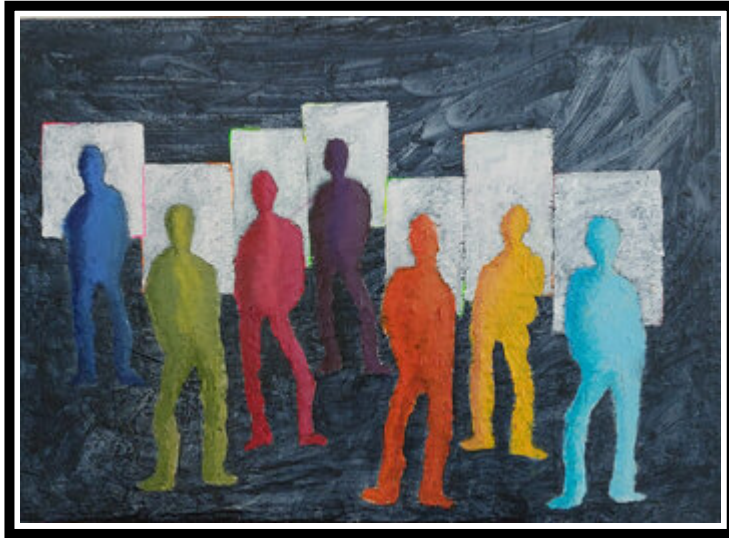
People in the spotlight