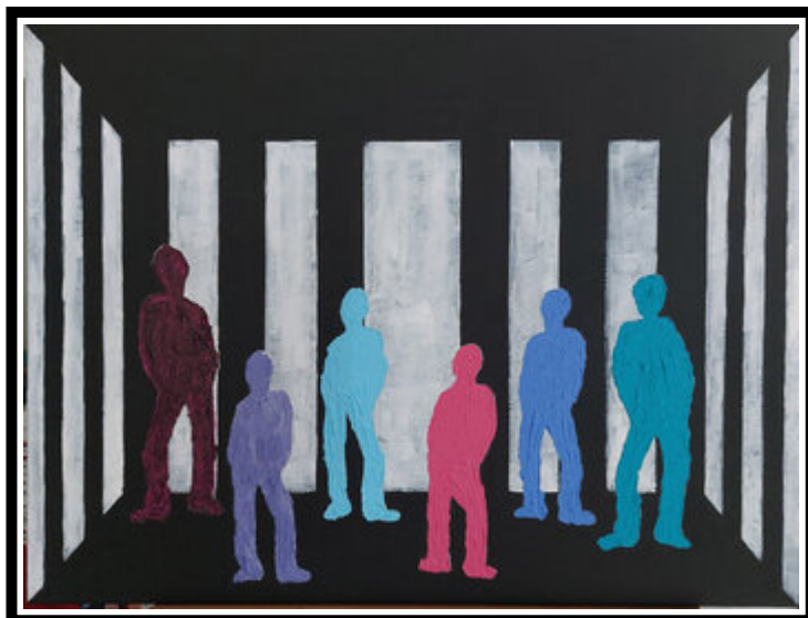
Men on stage