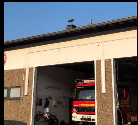
A fire station in Germany uses Starlink as a backup connection.

Communities and emergency services have also recognized the value of putting Starlink in place before disaster strikes. Whether it’s for a fire station seeking a backup communication system or for a city preparing for the next hurricane, an investment in Starlink can ensure that connectivity is there when people need to save lives, reach loved ones, and rebuild.