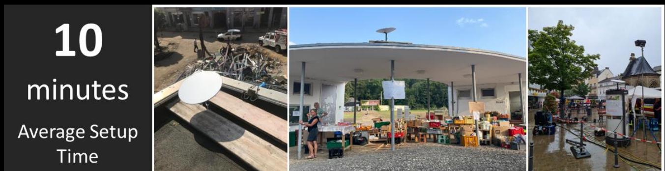
Relief workers were able to set up Starlink kits in flooded German communities within minutes.

In July 2021, Germany experienced its most deadly natural disaster in almost 60 years when severe floods swept through the country. Rescue efforts were hampered by the destruction of communication infrastructure. Citizens had no way to get in touch with family and loved ones. To aid recovery efforts, SpaceX deployed 100 Starlink user terminals to Germany within 48 hours, installing half at first-responder sites such as fire departments, hospitals, and rescue team housing.