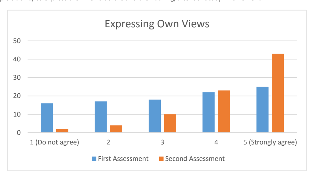
Figure 2: young people's ability to express their views before and then during/after advocacy involvement

The second assessment clearly evidences a marked improvement in children and young people's awareness of their rights. This is a significant finding given the project only ran for 9 months and some of the young people would have experienced shorter periods of advocacy support.