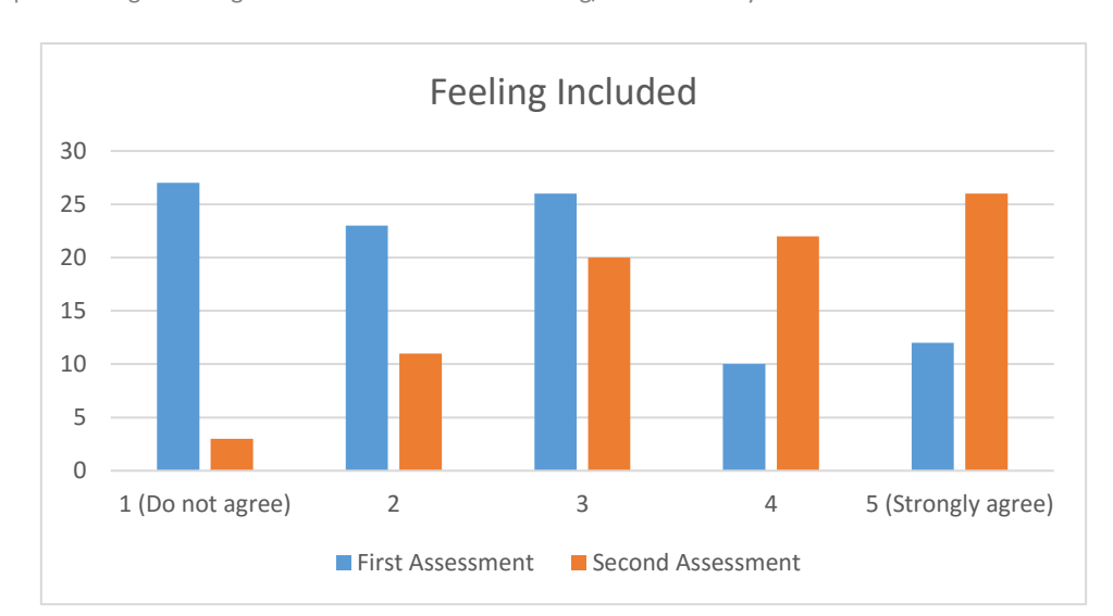
Figure 3: young people's feelings of being included before and then during/after advocacy involvement

Young people's ability and confidence in both identifying and expressing their own views is another key unique focus of advocacy work. Advocacy workers can enable this in two ways, by speaking on behalf of young people or supporting young people to express their own views. Advocacy practice is focused on building the self-advocacy skills of young people. It is evident from figure 2 that young people felt more confident at expressing their own views having received advocacy support, with a marked shift within the second assessments to the majority of young people strongly agreeing that they express their views.