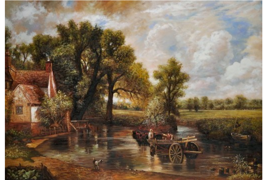
The Hay Wain. John Constable. 1821