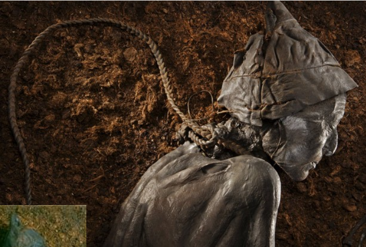
Tollund Man Denmark 1950 2,500 years old