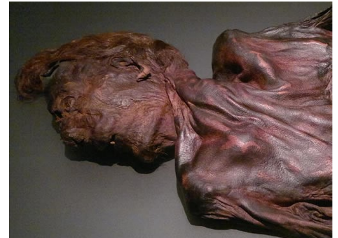
Cashell Man Ireland 2011 4,000 years old