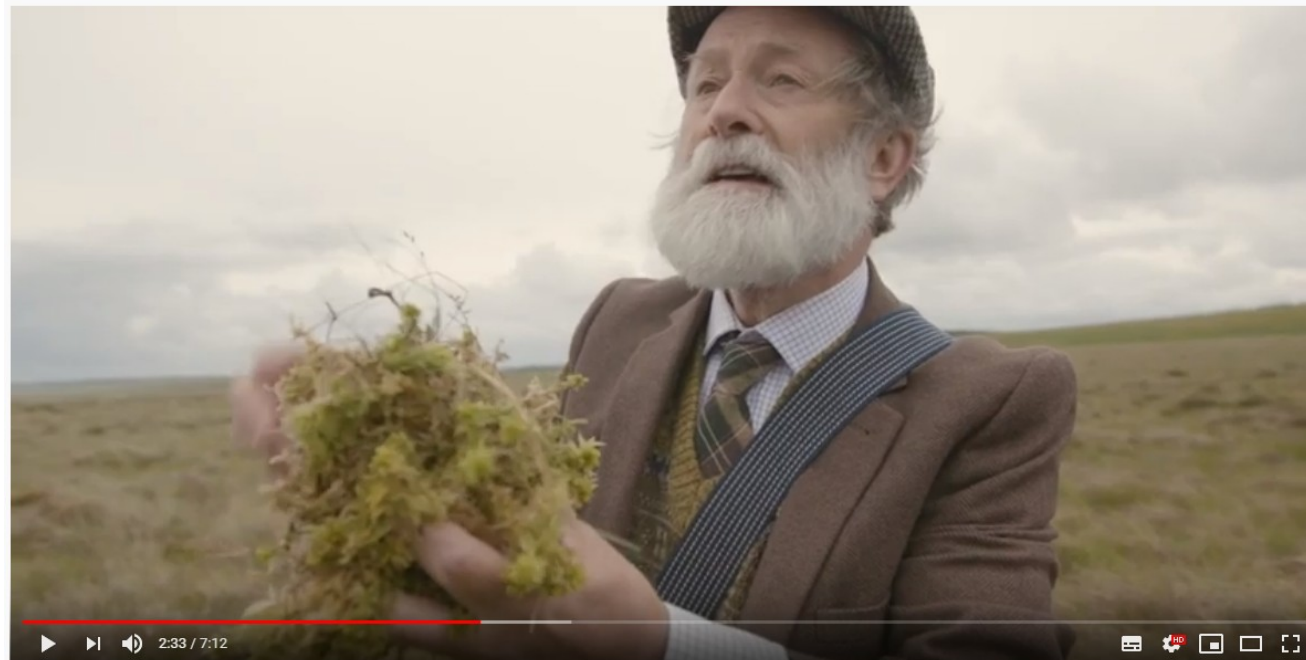
The Carbon Farmer