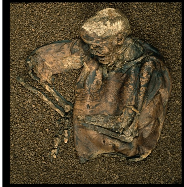
Lindow Man Cheshire 1984 2,000 years old