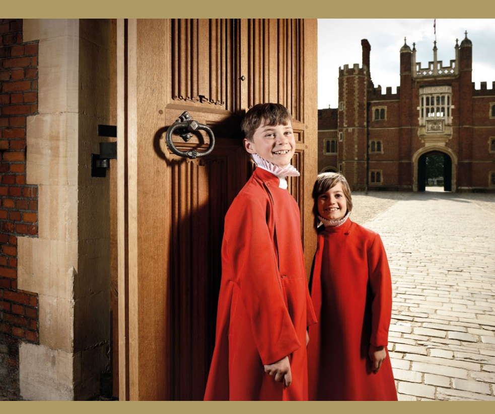
Giving Choral Music a Future