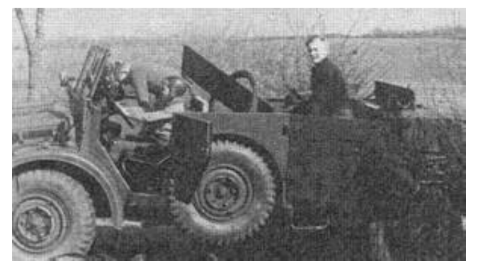
A German SdKfz 15 car damaged at Hokkerup in the early hours of April 9<sup>th</sup>, 1940. From Source 2.

The detachment was then marched towards south as prisoners of war, but due to the cease fire they were back with their units later the same day.