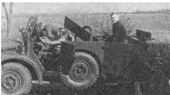
A German SdKfz 15 car damaged at Hokkerup in the early hours of April 9 th , 1940. From Source 2.

The detachment was then marched towards south as prisoners of war, but due to the cease fire they were back with their units later the same day.