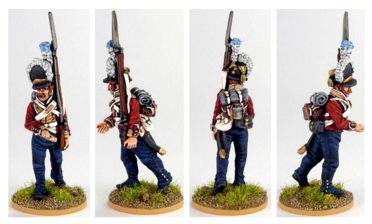
Detail of Norwegian grenadiers DAN 4