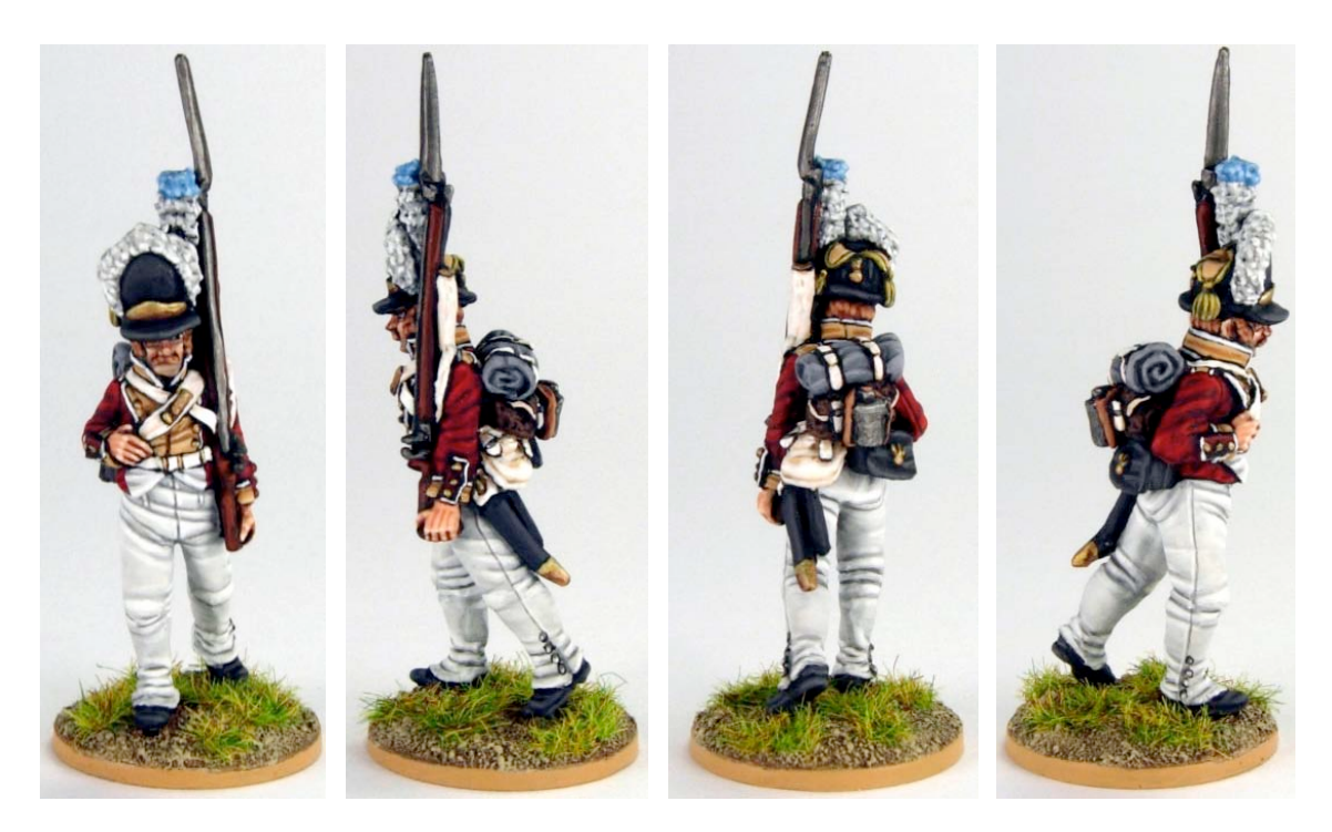
Detail of Norwegian grenadiers DAN 4.

normally did not wear this hat model, but preferred to use the standard M1803 officers' hat (as found in command set DAN 3).