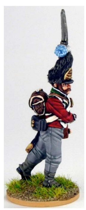
Detail of grenadier DAN 9