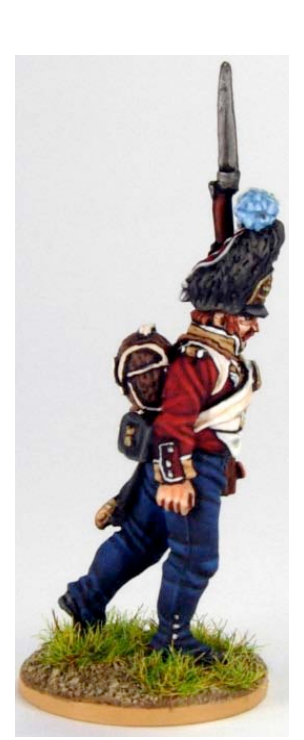
Detail of grenadier DAN 9