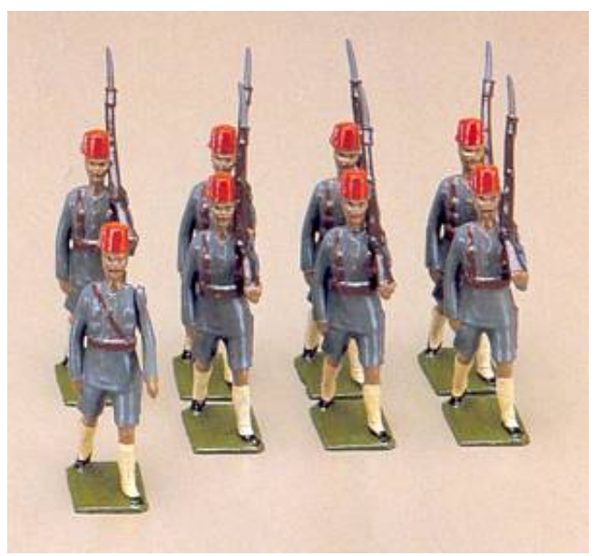
Britains special paint - Egyptian Infantry, 1938. From Source 1.

The figures shown here are a paint variation of the King's African Rifles figures, representing Egyptian infantry.