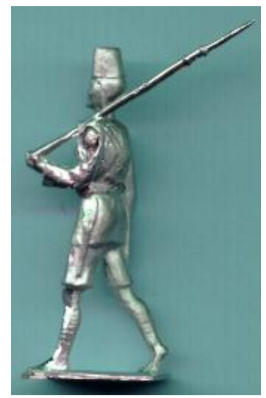
Recast of Britains King's African Rifles figure. Casting C-192 from London Bridge Collector Toys.

While original figures are becoming scarce and/or expensive, one may be tempted to create one's own figures. To this end, castings of original figures will come handy.