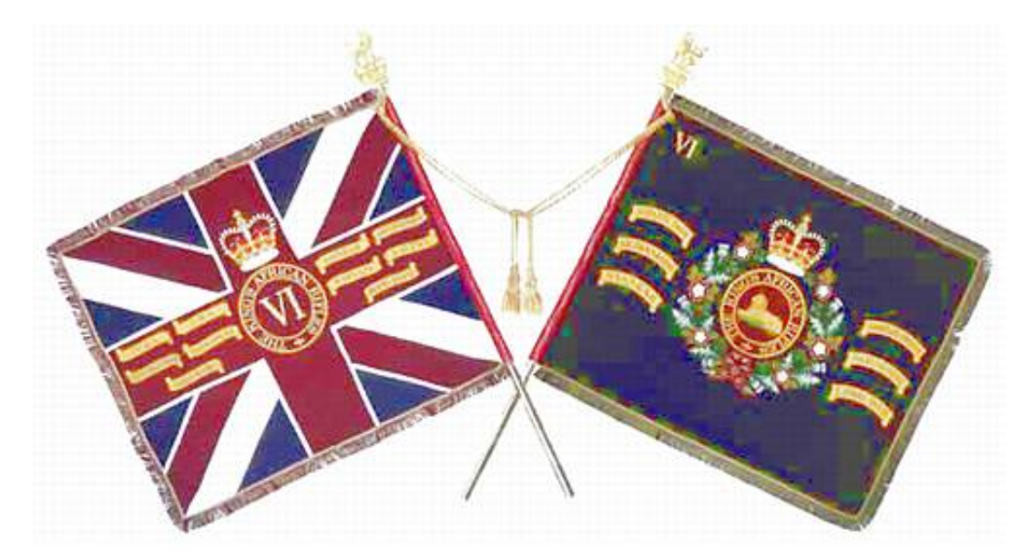
Regimental Colours - 6<sup>th</sup> Bn. King's African Rifles (Tanganyika). From The Regimental Association of The King's African Rifles & East African Forces.

At the time we discussed how the colours did look like, but since then a number of sources have come to my attention, the last one just recently.