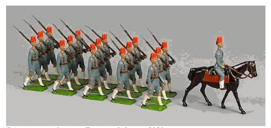
Britains special paint - Egyptian Infantry, 1938 From Bonhams' homepage.