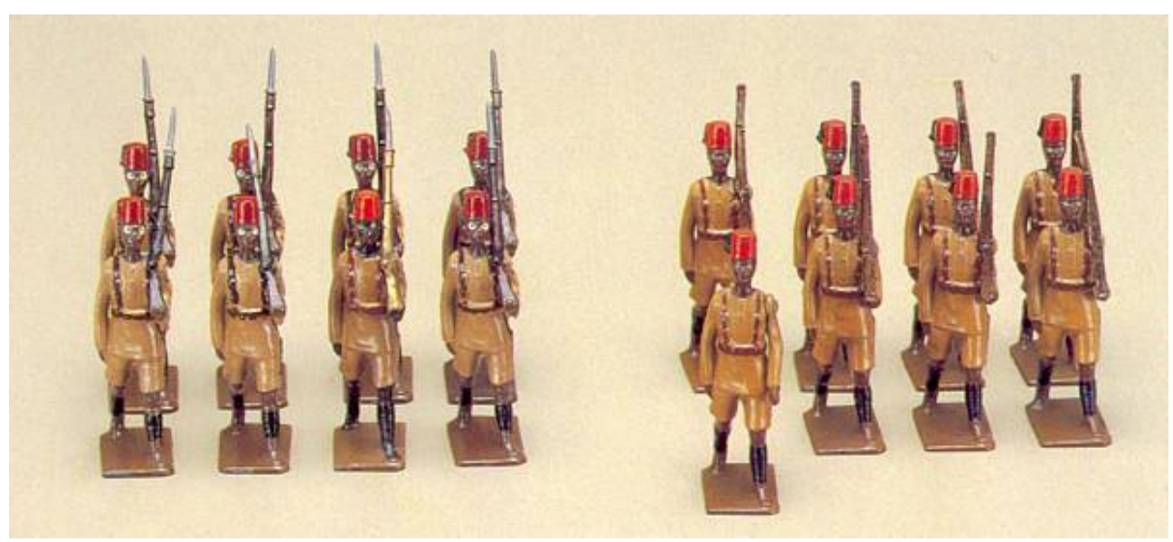
Britains No. 225: King's African Rifles. From Source 1.

Britains Ltd. introduced their King's African Rifles figure in 1926, and it came very close to the real King's African Rifles. For further reference, see my article on The King's African Rifles.