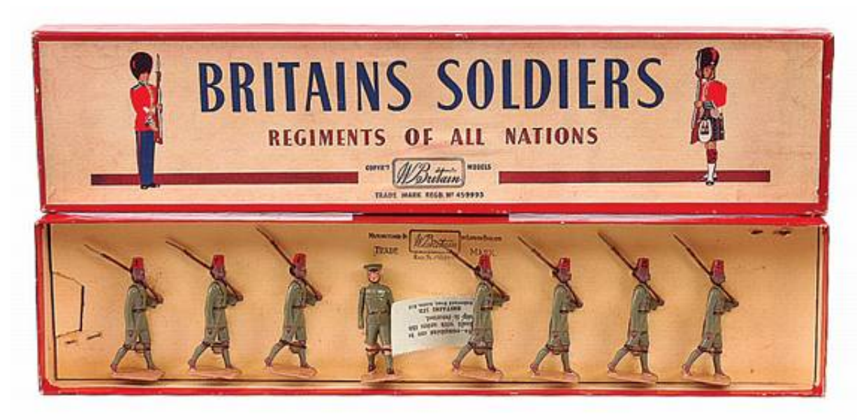
Britains No. 2020: Portuguese East African Native Infantry From Vectis.