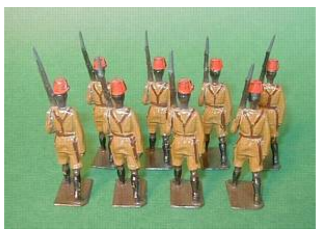
Britains No. 225: King's African Rifles.

... but seen from behind - with their Y-shaped straps - the equipment are similar to the basic German type.