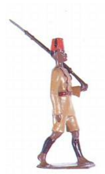
Britains No. 225: King's African Rifles. From Source 4.

The figures to the left in the photo are the standard configuration of Set 225 - 8 native soldiers. The figures to the right are a special version, including a native officer - the standard figure with a "plain" arm; the rifle arm is another type, with a rifle, without bayonet.