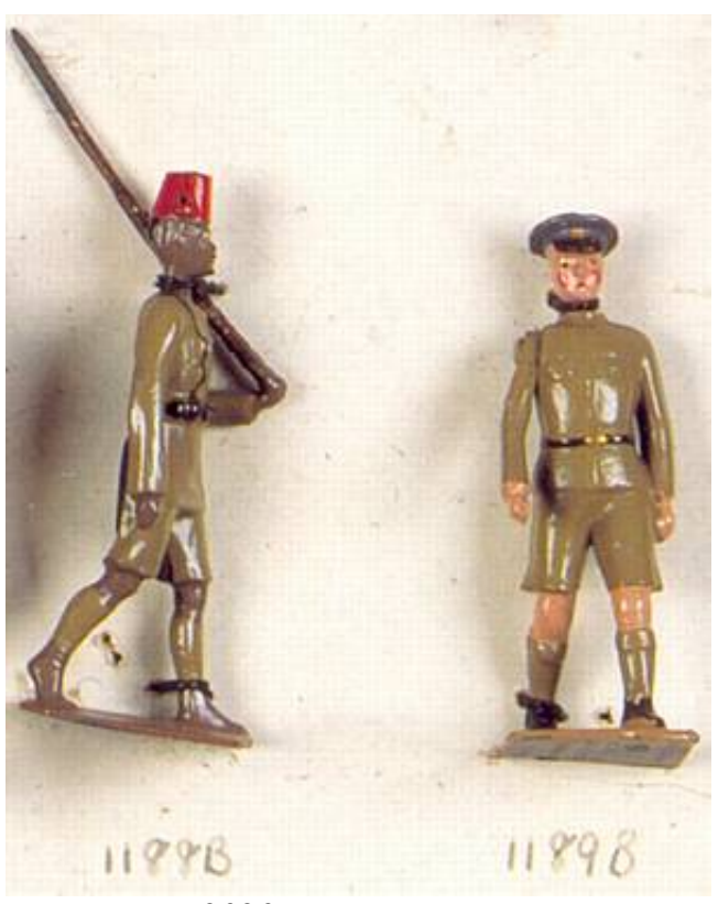
Britains No. 2020: Portuguese East African Native Infantry. From Source 5.

An even rarer variation is the post-war Britains set 2020: Portuguese East African Native Infantry.