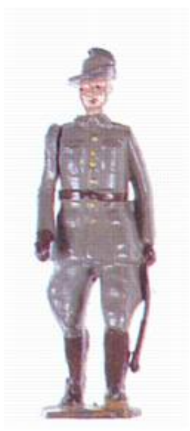
Britains No. 1544: Australian Infantry, Service Dress, officer. From Source 4.

From a collector's perspective, an officer figure is in great demand. The above example is today almost unobtainable, or in a price league out of reach for most collectors. Consequently, you will have to look for other sources, either your own creations or figures from other sets.