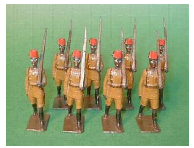
Britains No. 225: King's African Rifles.

The King's and Regimental Colours can be seen in the middle of the parade.