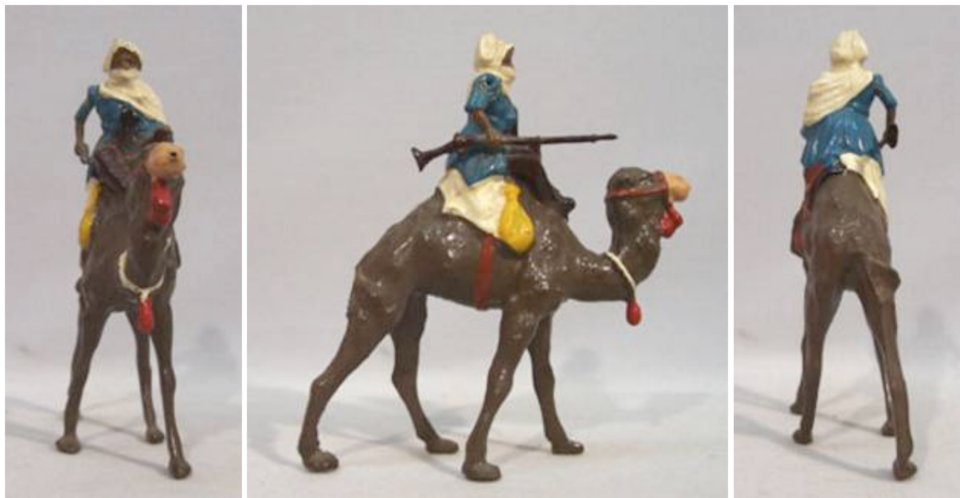
A camel rider from Britains Set 224, seen for sale on eBay.

The camel rider is probably one of the most impressive and elegant of all Britains figures, reflecting the archetype of Bedouin Arabs, mounted on a slow but steady moving "Ship of the Desert", as camels are often called.. Throughout its life span, the figure was always produced carrying a jezail, and with the rider in blue, red or green burnoose.