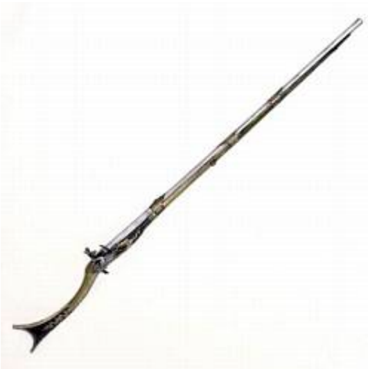
A jezail, flintlock musket. From Jezail