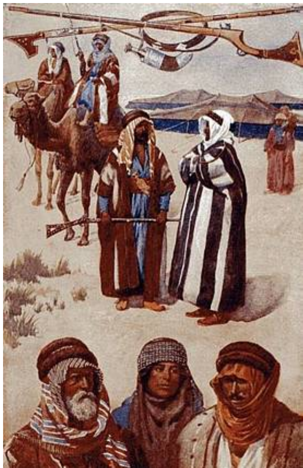
Arabs of the Desert. From Source 4.

Britains produced their first set of Bedouin Arabs, in 1911, and in various configurations continued to do so until 1966, when most of the firm's hollow cast production ceased.