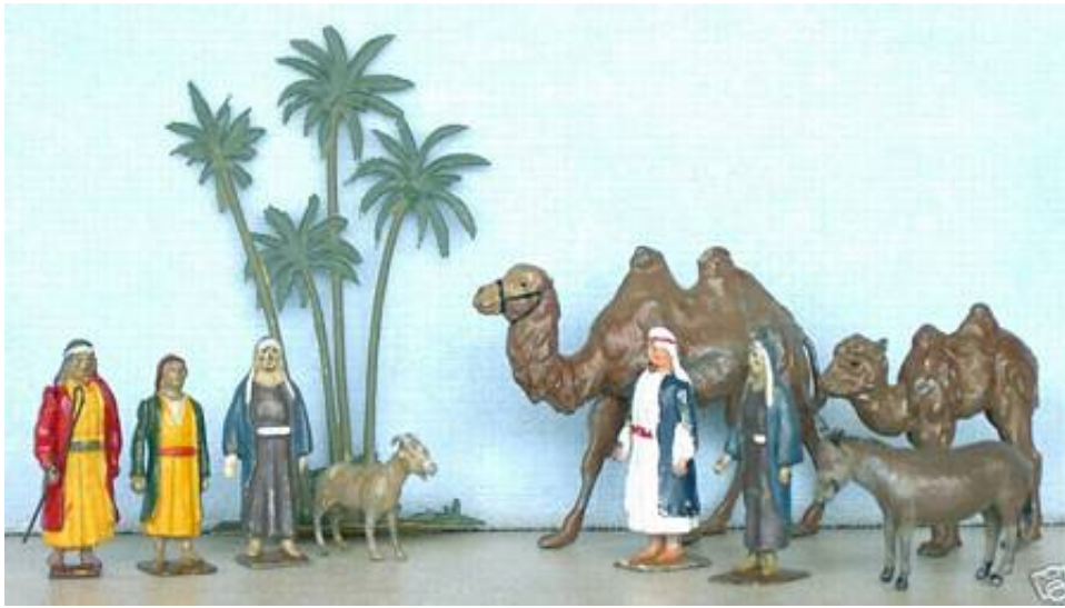
Part of Britains Set 1313: Eastern Peoples, from the 1950'ies; seen for sale on eBay.

1314 Two Eastern men and a woman, a boy, a shepherd; with camels, donkeys and coconut and date palms