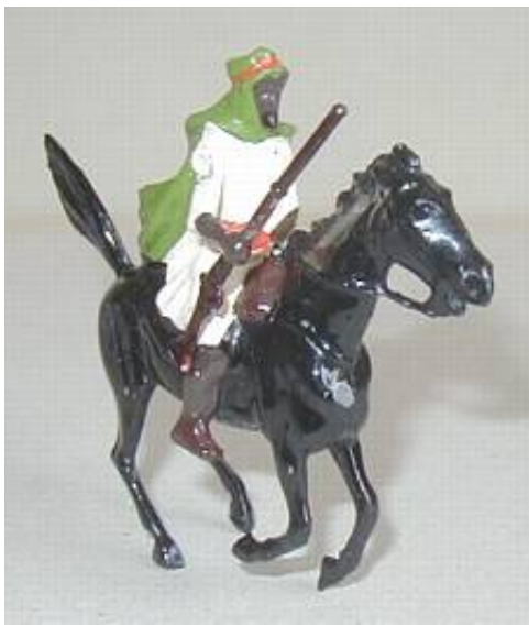
Two figures from Britains Set 164: Arabs on Horses.