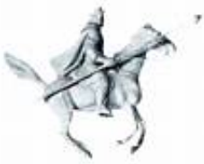
1232B Mounted, with Spear.