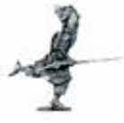
1231B Running with Rifle.

Anyway, the catalogues presented nice photos of the various figures, showing the various types under the header of Arabs .