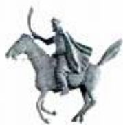
40B Mounted, with Scimitar.