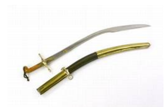
A scimitar. From Scimitar (National Maritime Collection).

The weapons shown on the figures could be considered as generic indigenous weapons, the sword (scimitar) and the spear being traditional weapons used for thousands of years, supplemented by the musket (jezail) of newer origin.