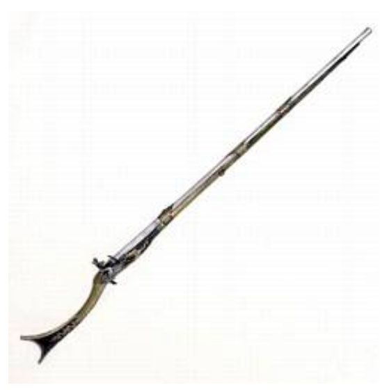
A jezail, flintlock musket. From Jezail