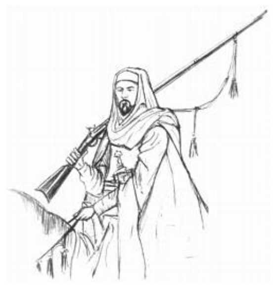
Bedouin Arab, drawn by Ron Poulter . From Wargames Illustrated, No. 263, June 2007.

When production of the toy soldiers began, the jezail in real life may have substituted by rifles of European manufacture. However, the flintlock musket still had its advantages since bullets could be produced locally. The calibre of the jezail shown below is given as 0.75 (19mm)