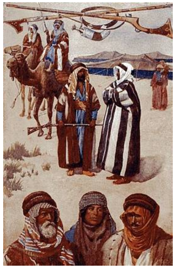
Arabs of the Desert. From Source 4.

Britains produced their first set of Bedouin Arabs, in 1911, and in various configurations continued to do so until 1966, when most of the firm's hollow cast production ceased.