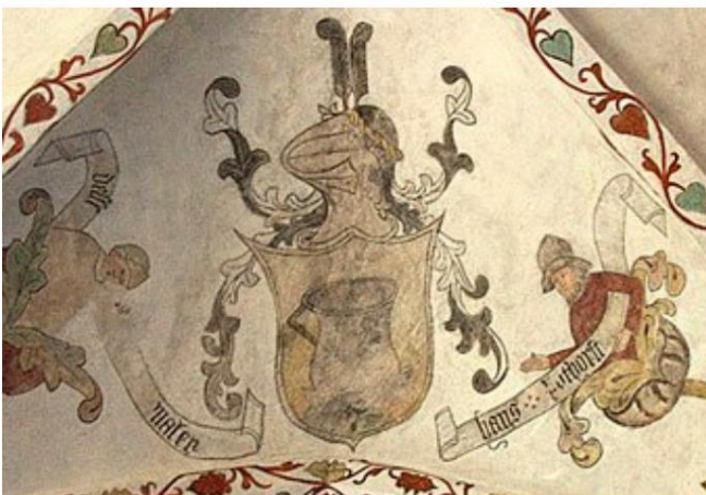
Pothorst is depicted together with his coat of arms, on a fresco in Sankt Maria Kirke in Helsingør.

These were experienced and extremely tough people who were used to operating in waters with enemies and pirates.