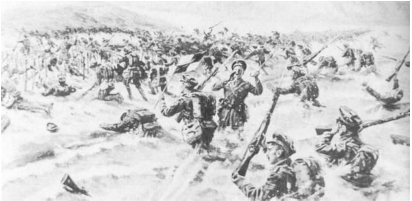
Lancashire Fusiliers landing on W Beach, Gallipoli, 25 April 1915. From Source 3.

Virtually everything went wrong at this landing in the early morning hours of 25 April 1915 and the battalion lost more than 500 men killed and wounded.