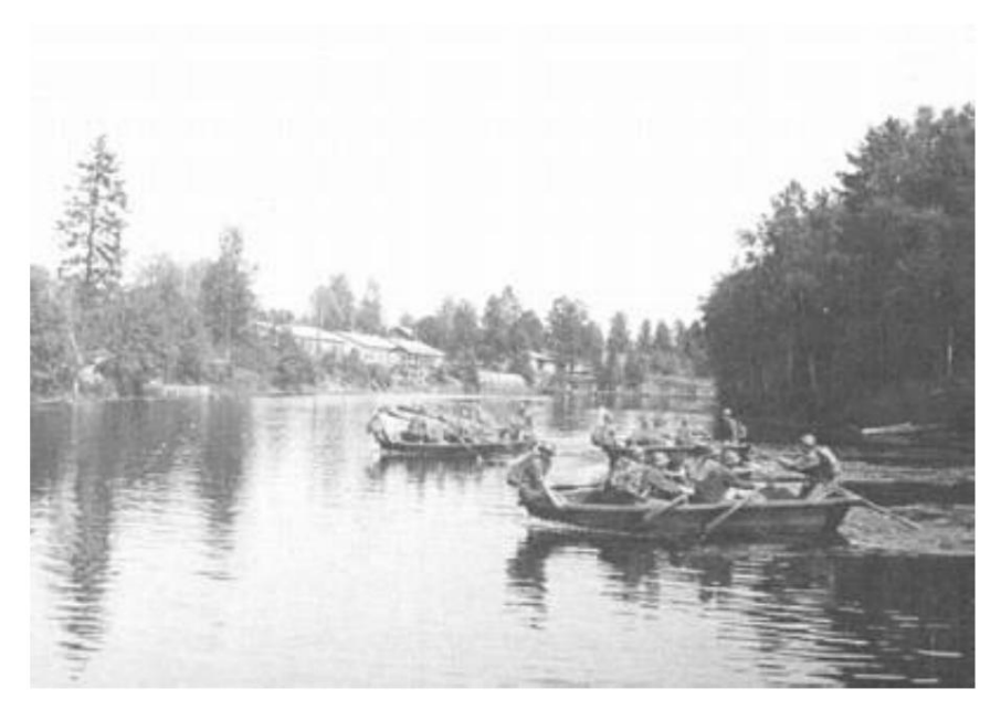
Norwegian pioneer soldiers practice crossing streams in Voxna Camp, approx. 1944. From Source 8.

In addition to the boat's driver, an island boat could carry 6 men with full field equipment.