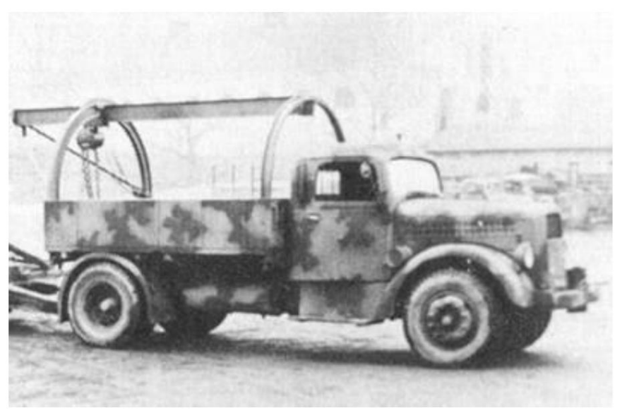
Scania-Vabis truck LB350. From Source 9.

The truck was, among other things, used by the engineer troops as a means of traction for block wagons with bulldozers.