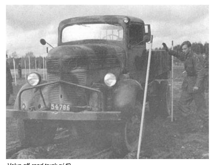
Volvo off-road truck n/42. From advertising brochure for Military Vehicles Museum Malmköping. The truck here is not necessarily associated with the engineering troops, but is more shown as an example of a type of truck, which of course is also used in the engineering companies.

The truck was, among other things, used by the engineer troops as a means of traction for block wagons with bulldozers.