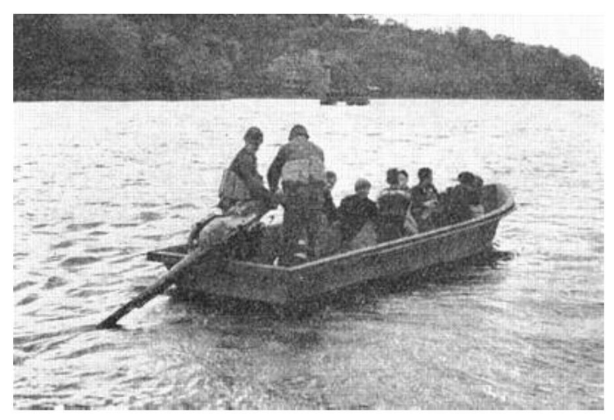
An overshipping boat m/33, the photograph below

In relation to Operation Rädda Denmark, the engineering troops had to provide the approx. 800 stormtroopers, which, upon landing on the open coast, were to bring the invasion force ashore from fishing cutters and other vessels.