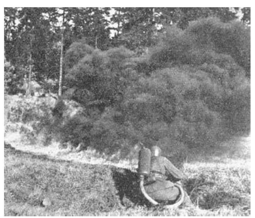
Flamethrower w/41. From Source 7.

In 1939, the engineer battalions in the infantry divisions were mainly horse-drawn, while the corps engineer battalions were motor-drawn.