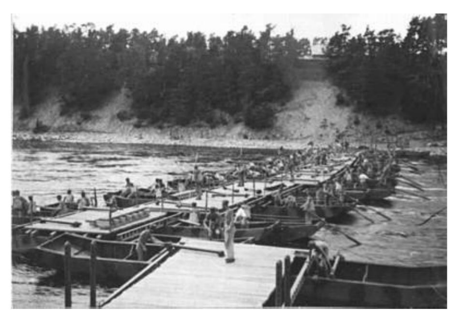
125 m long pontoon bridge over Dalälven, at Laxön; load capacity 15 tons. The picture was found on the Internet.

The engineer troops' field bridge equipment would also have played a significant role in connection with a possible landing operation in Denmark, i.a. in the form of ferries, which could transport material ashore from cargo ships, unanchored off the Øresund coast.