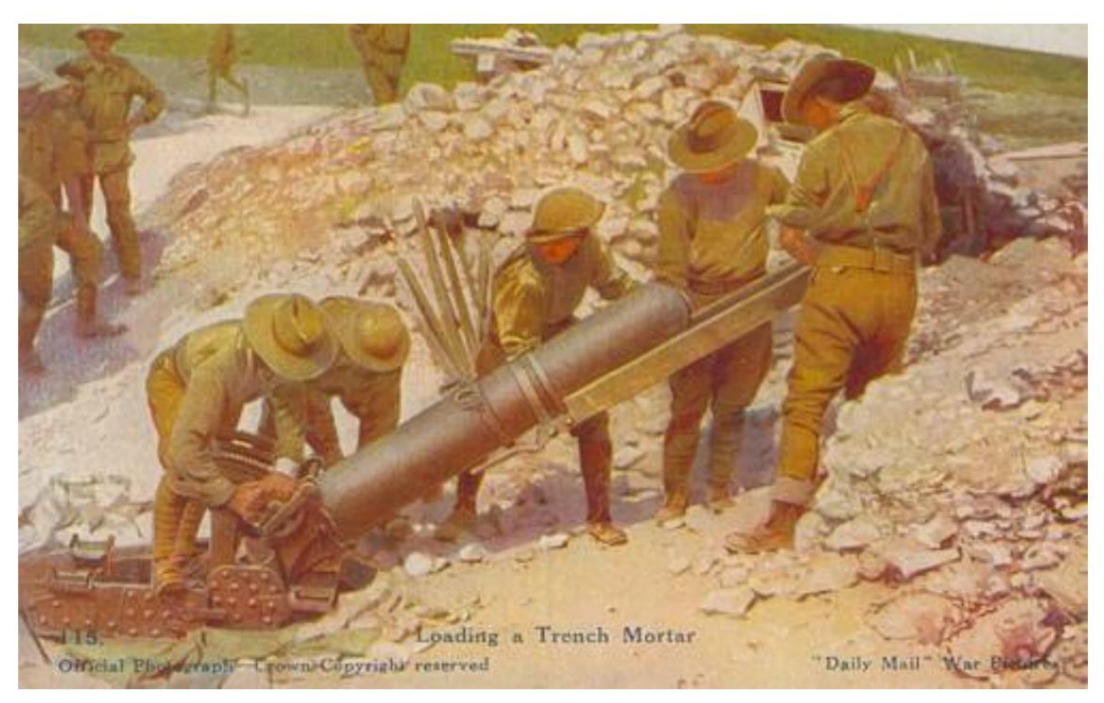
Loading a Trench Mortar, approx. 1916.

A heavy trench mortar battery consisted of 3 officers as well as 66 non-commissioned officers and privates.