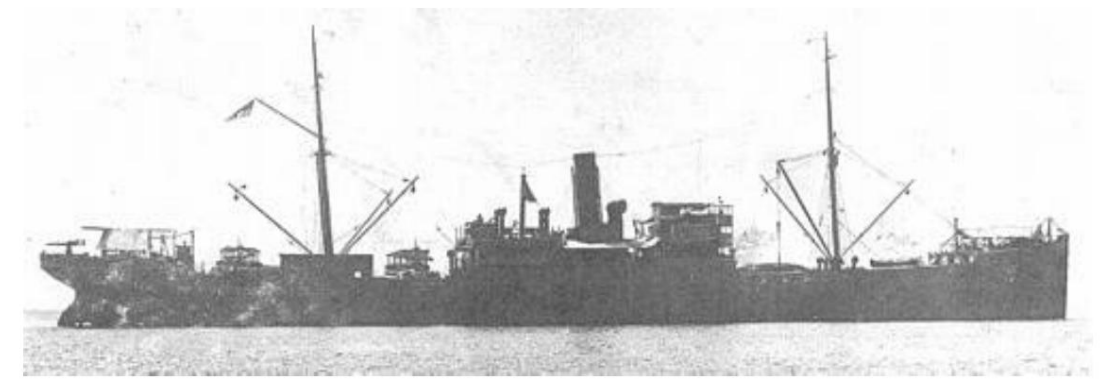
SS AENNE RICKMERS, here as HMS ANNE.

The French seaplanes operated along the Turkish coast (Palestine, Syria and Anatolia) and operated from the motherships SS AENNE RICKMERS and SS RABENFELS.