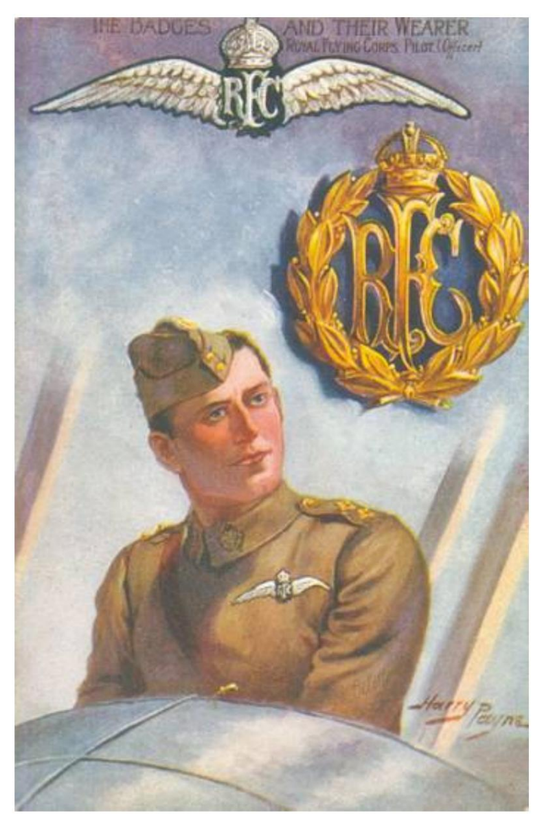
Royal Flying Corps, c. 1914. Drawn by Harry Payne.

The French planes were not much better off, but thanks to aerial reconnaissance, the British were able to follow the Turkish advance.