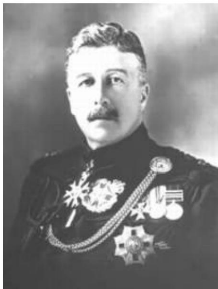
Arthur Foljambe, Earl of Liverpool. From The Governor-General of New Zealand.

One of the units that makes a brief appearance during the fighting in Egypt is the wartime regiment, the New Zealand Rifle Brigade.