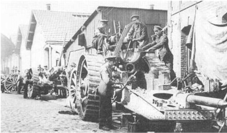
Army Ordnance Corps

Preparation of artillery pamphlets prior to issue, 1917.