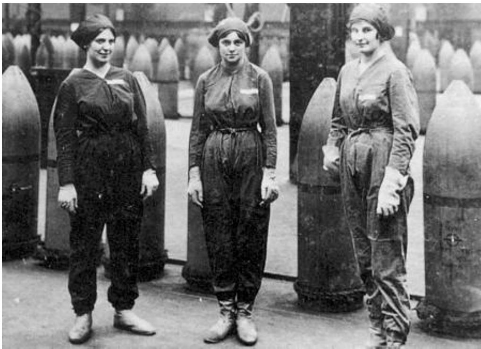
Women Munitions Workers, 1918.