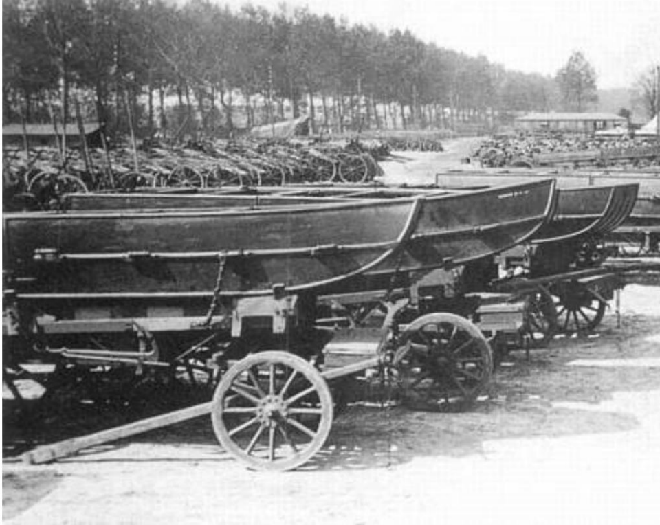
Army Ordnance Corps - Depot with pontoon wagons and wooden wagons, 1915. From Source 3.

A very large number of civilians were therefore involved in the manufacturing work, including a large number of women who participated in the manufacture of ammunition.