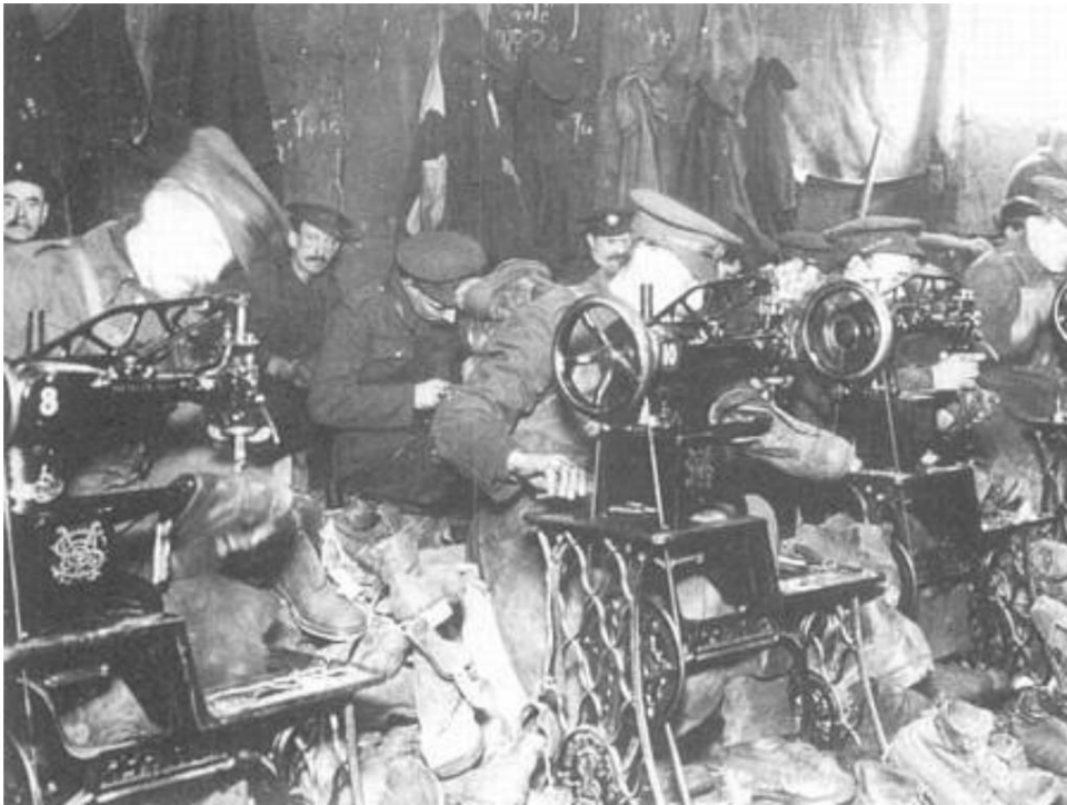
Army Ordnance Corps - Manufacture of boots, 1915.