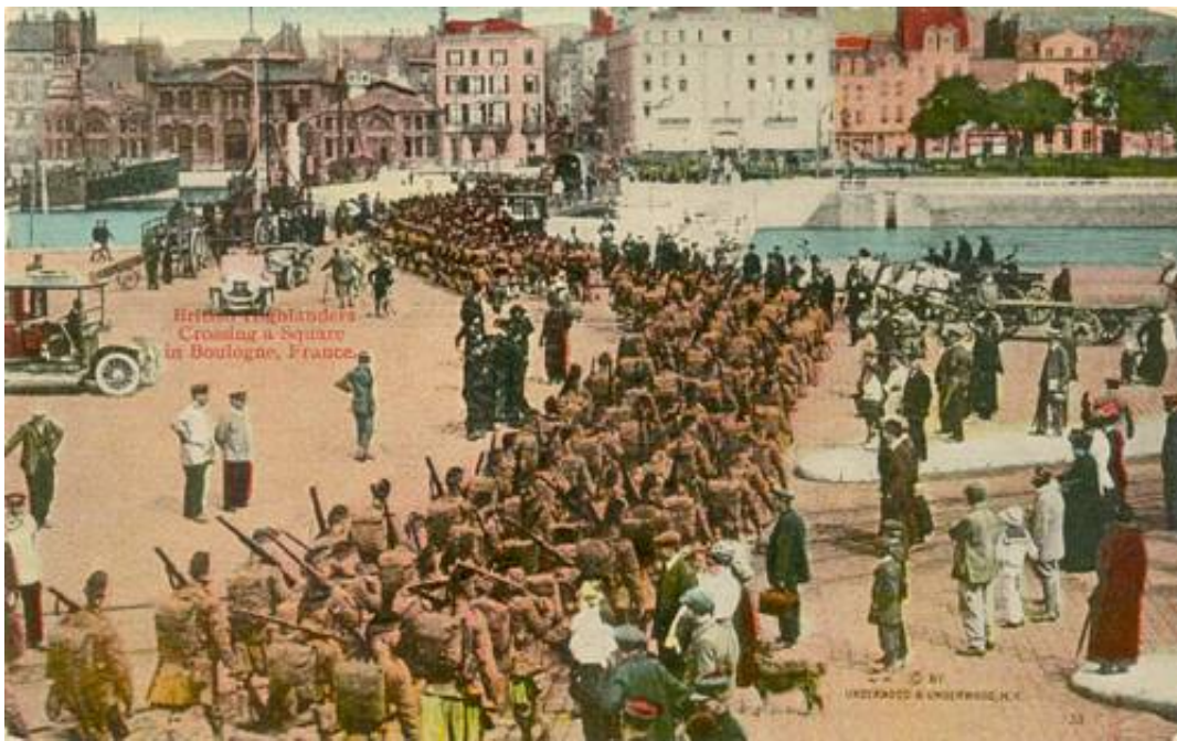
Highlanders, Crossing a Square in Boulogne, 1914. This contemporary coloured postcard, published by Underwood & Underwood, New York, may show

At Néry, the 2 nd Argyll and Sutherland Highlanders were also sent forward in support of 1 st Cavalry Brigade, but arrived after the fighting. On seeing the breakfast prepared by the 5 th Dragoon Guards, who have had no time to eat it, the Highlanders quickly disposed of it, with a healthy appetite.