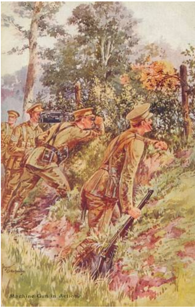
Machine Gun in Action, ca. 1914.

Contemporary postcard by Edgar A. Holloway, published by Gale & Polden, Aldershot.