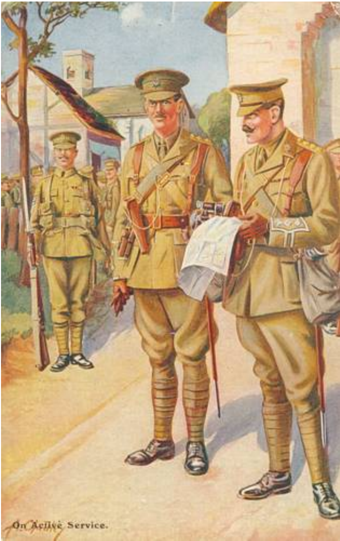
British Infantry on Active Service, ca. 1914. Contemporary postcard, published by Gale & Polden, Aldershot.