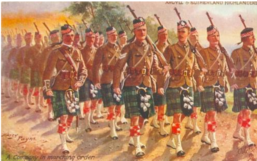
Argyll and Sutherland Highlanders, A company in marching order, ca. 1912. Contemporary postcard by Harry Payne, published by Raphael Tuck & Sons.

For a more 1914'ish look, one must imagine the kilts covered by khaki aprons, and the white gaiters substituted by khaki ones.