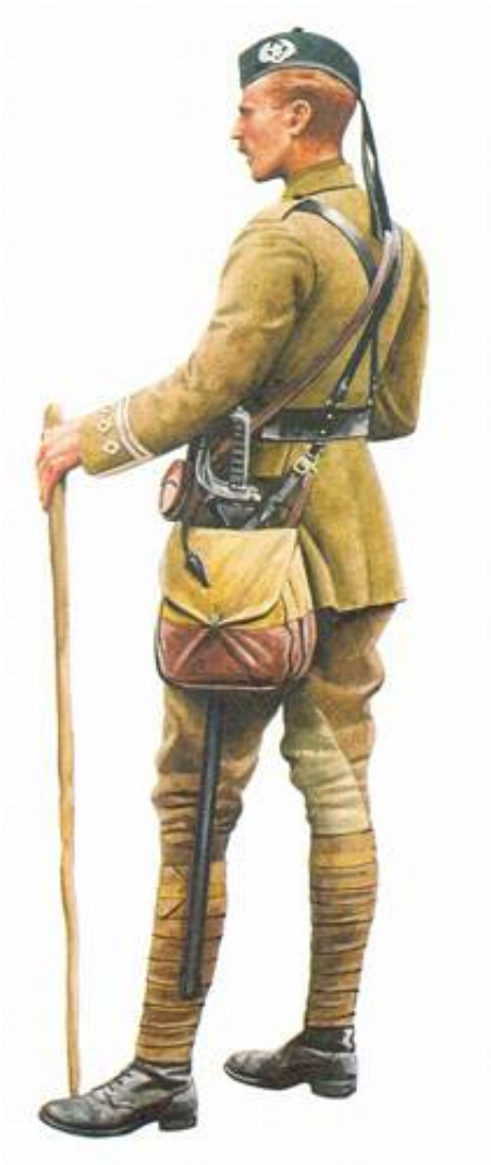
Captain, 1 st The Cameronians (Scottish Rifles), 1914. From Source 6.

The 1 st Bn. Middlesex Regiment and the 1 st Bn. Cameronians landed at Le Havre; 2 nd Bn. Welch Fusiliers landed in Rouen.