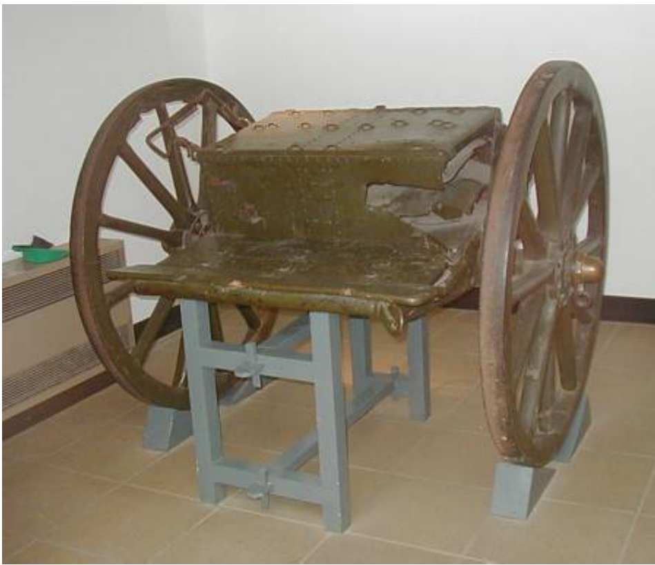
Ammunition wagon from 'L' Battery, Royal Horse Artillery, damaged at Nėry on 1 September 1914.

One of 'L' Battery's ammunition wagons is displayed in the The Land Warfare Hall at Imperial War Museum Duxford, where I photographed it in November 2001.