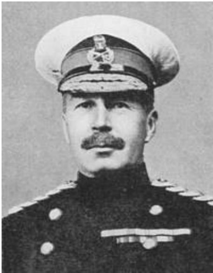
Brigadier-General Sir Henry Lukin, Commander of the 1st South African Infantry Brigade.