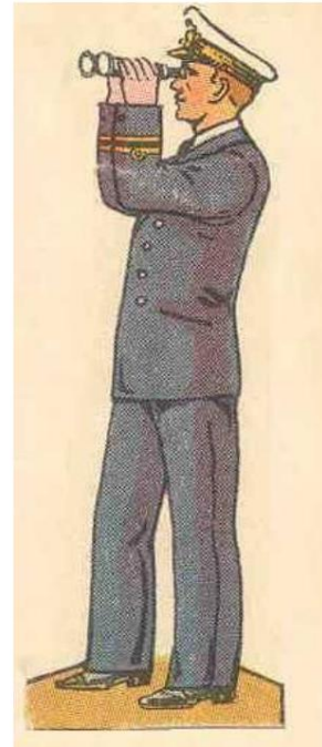
Sea Lieutenant 1