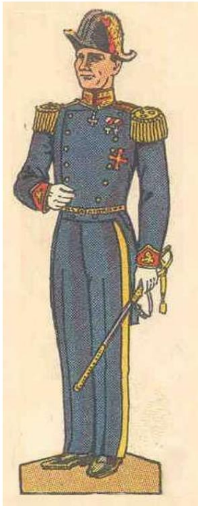
Admiral (Crown Prince Frederik sener the IX ) War captain