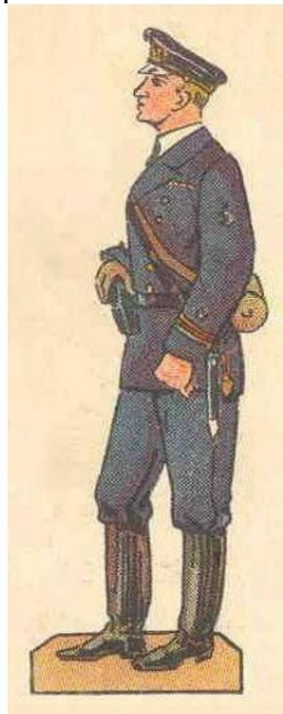
Quartermaster of the 3rd degree.