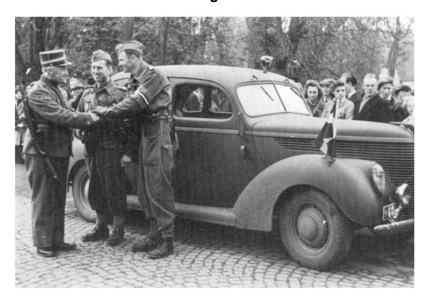
Danish border police and a field police section in Kruså, 6 May 1945.

The control work at the Danish-German border thus became the Field Police's most important effort, and it succeeded, together with other units from the Brigade, in arresting around 1,000 of the wanted persons on the red list, among other things.