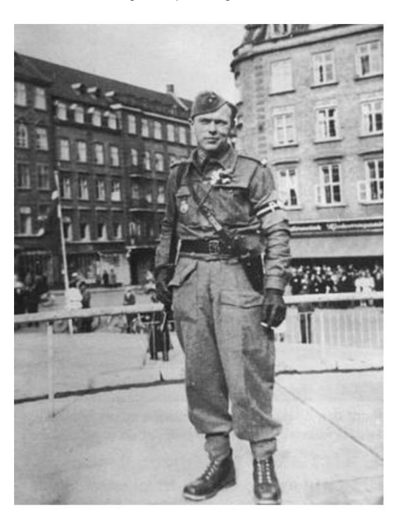
Field police soldier, Aarhus, 6 May 1945.

of: • Chief with command group (10), 1st Platoon (18) and 2nd Platoon (38) • 34 vehicles, including Ford passenger cars Model 38/39 and a number of motorcycles.