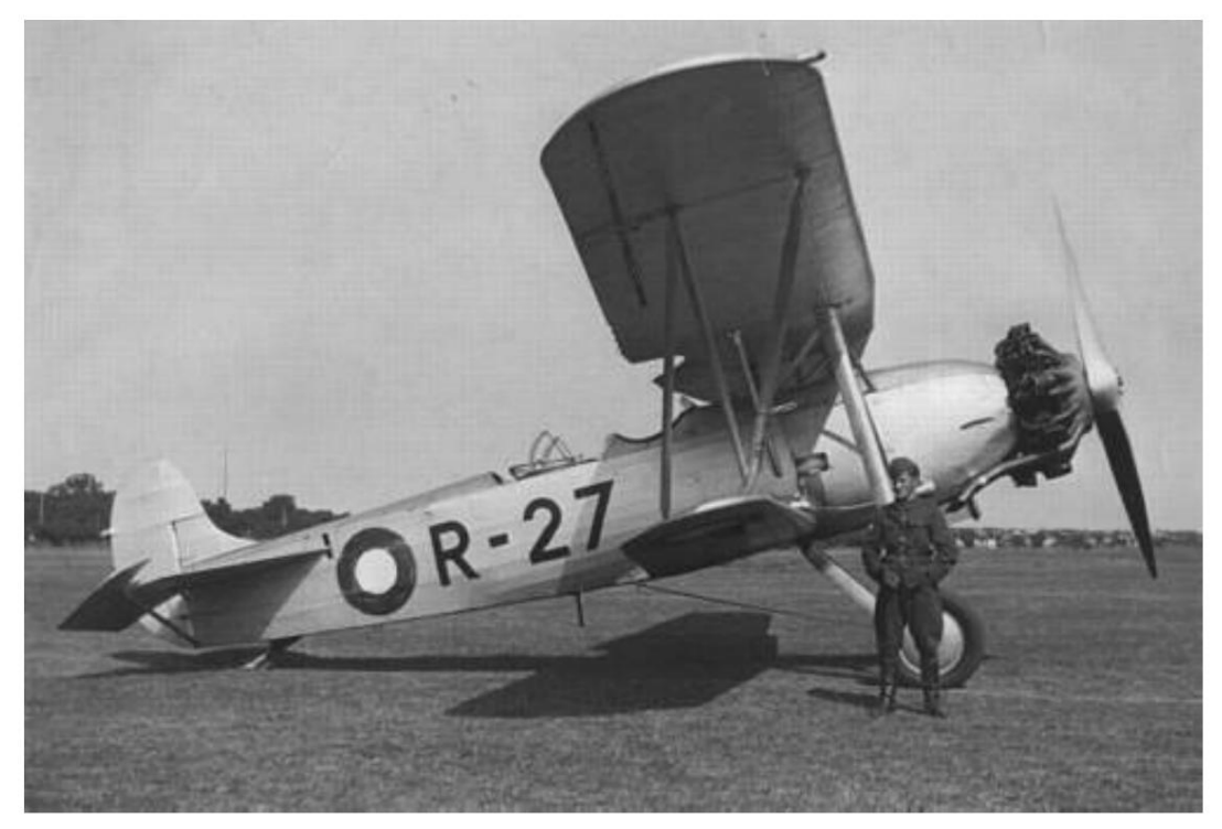
Fokker CVM/33 (II R).