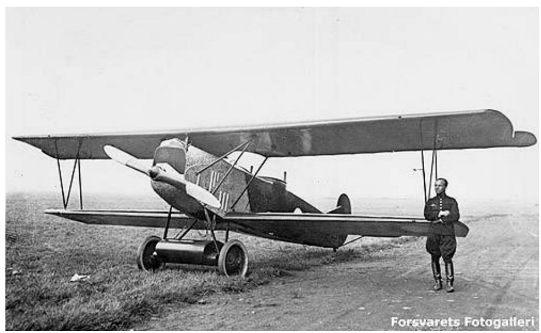
Breeder C 1.

Two Fokker machines were delivered on 30 September and 13 October 1923 respectively, and three of a slightly older type were built by the Air Force Workshops in 1925. They were originally numbered 2-6 (1 was not used), but in 1926 were renumbered O -51 - O-55. The last CI was taken out of service in 1933.