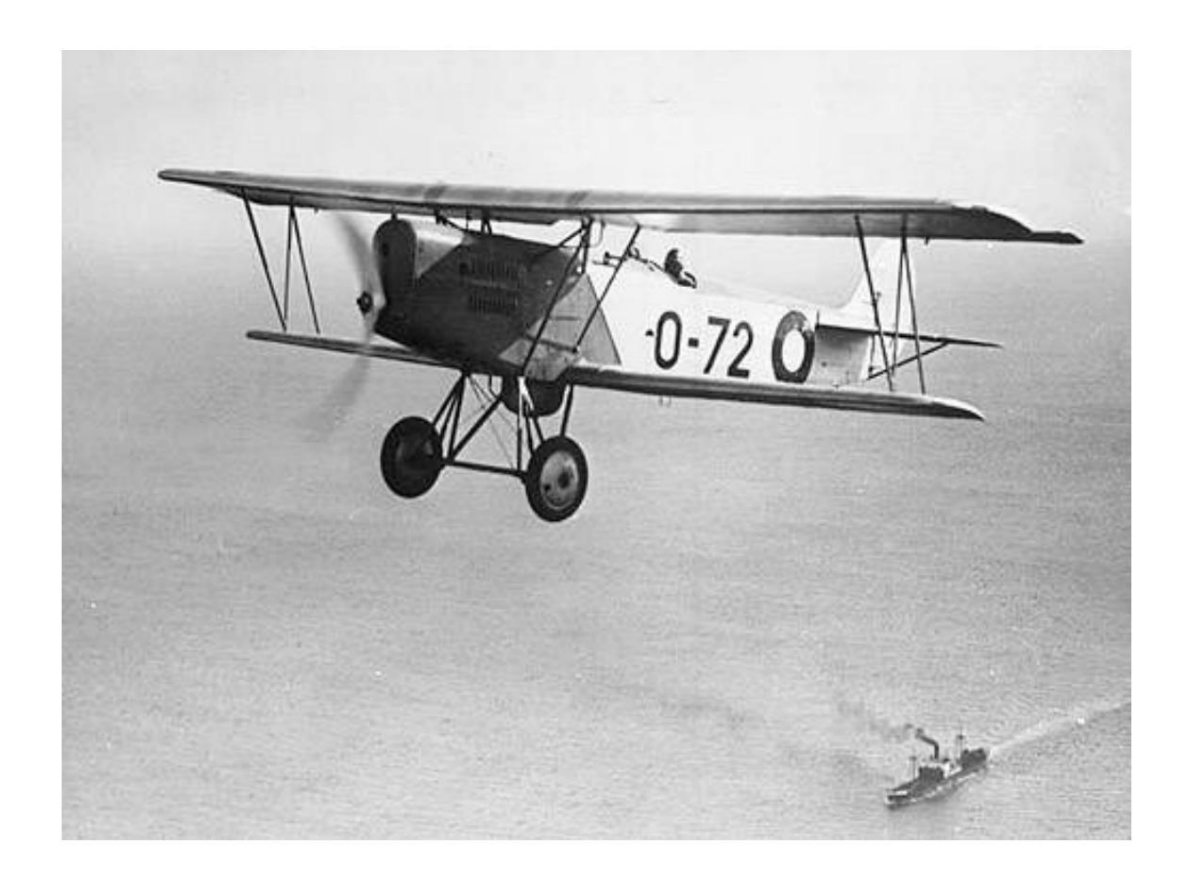
O machine (II O). From the Air Force's Historical Collection.

The O-machine is mentioned in Cut-out sheet: Danske Fly, circa 1935, Part 1. However, the picture shows the machine in the single-seat version II O, while the drawing on the cut-out sheet clearly shows both pilot and observer.