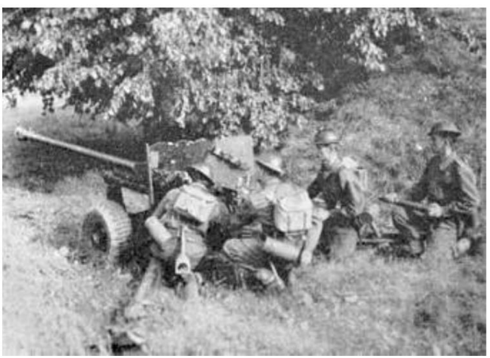
57 mm anti-tank gun M.45e. From Source 1.

As a curiosity, it can be stated that other contemporary clipping sheets also show Danish material from before 29 August 1943 in combination with Danish soldiers after 5 May 1945 - see e.g. my article Scrapbook - Danish soldiers, 1945.