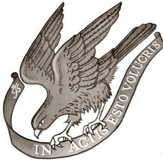
The old regimental badge

With a political decision of reducing the army in 1999 and the amalgamation of three old regiments - all of them with a very long history - the state of play came to an end. The name of the regiment continued to be GARDEHUSARREGIMENTET.