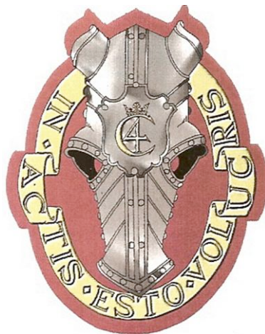
The new regimental badge

But in an effort to make everybody satisfied, it was decided that the "new" regiment had to obtain a new badge.