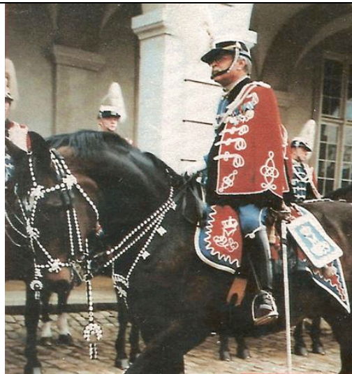
Mounted officer. Notice how the pelisse looks too scarlet. Notice how the sabre is fastened at the saddle, when mounted.