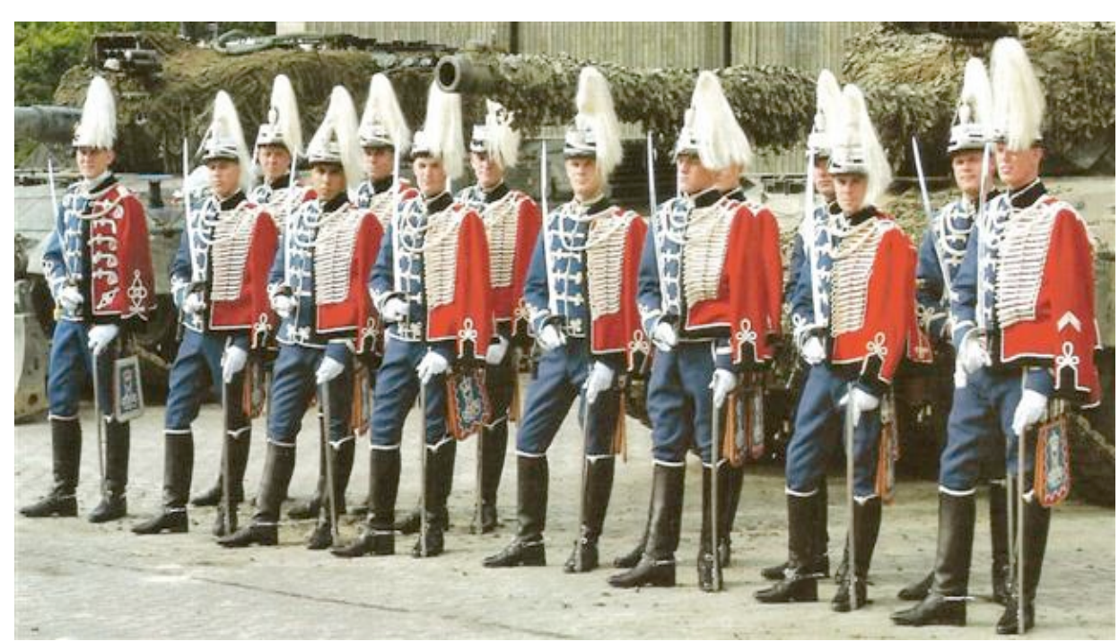
Officer, NCO and privates training for foot duty at court.