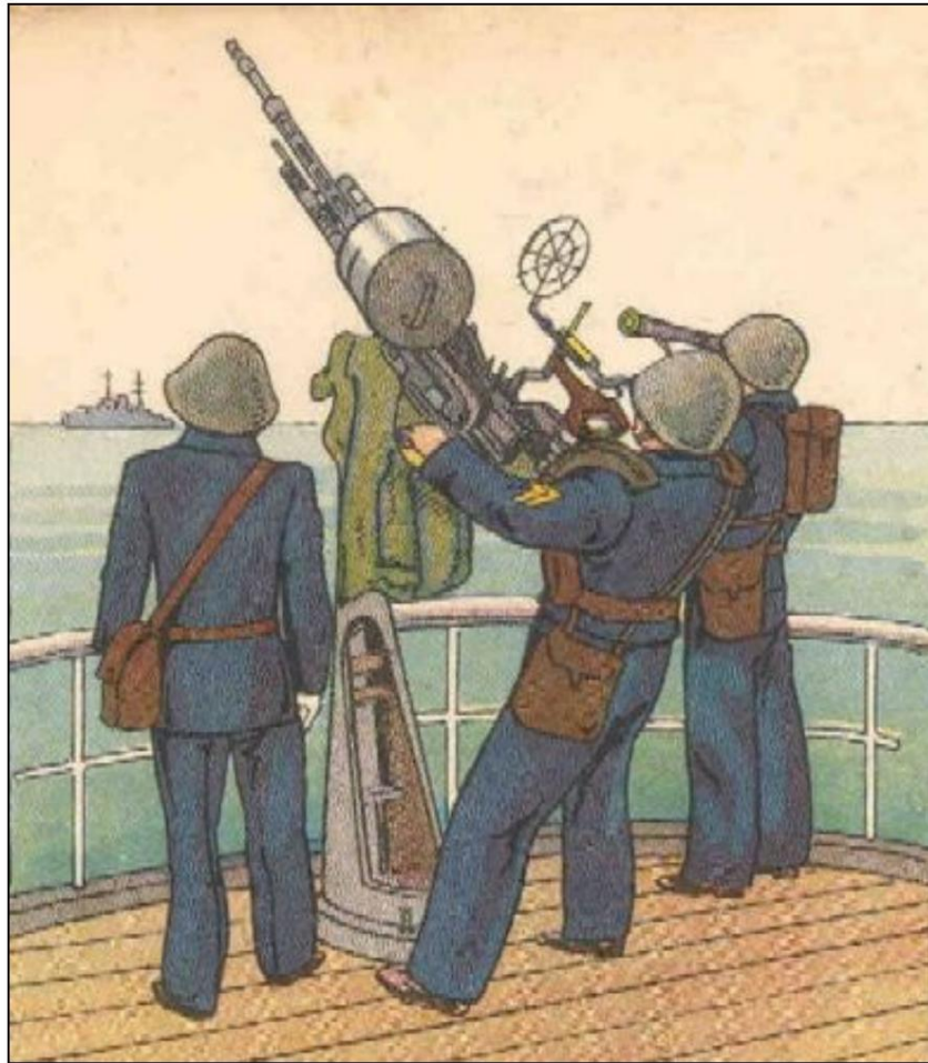
20 mm machine gun

(The gunner is a quartermaster of the 2nd degree.)