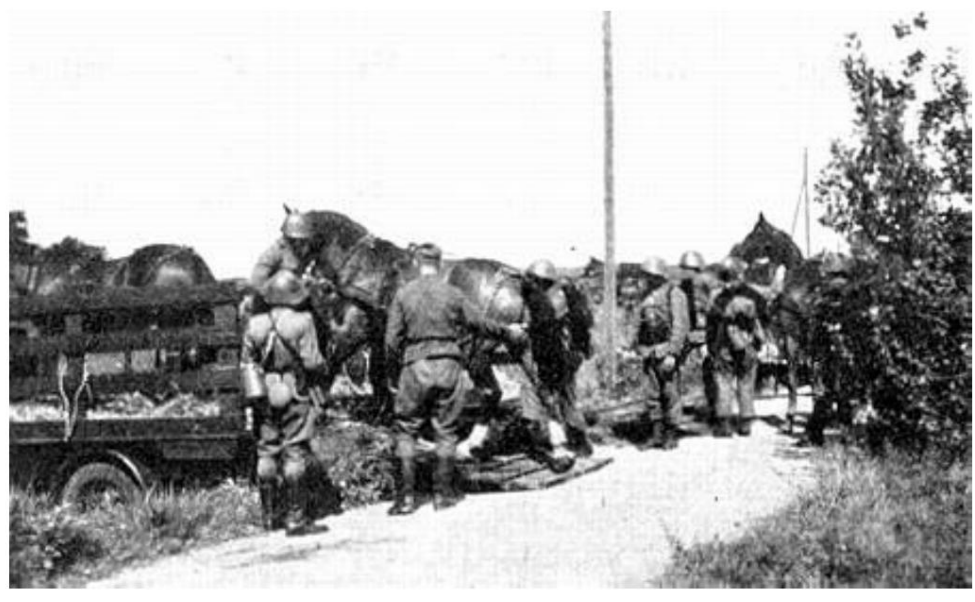
Horse transport. From Source 5.

If there is a need to advance the protection company quickly and/or over longer distances, both personnel and material can be advanced on trucks.