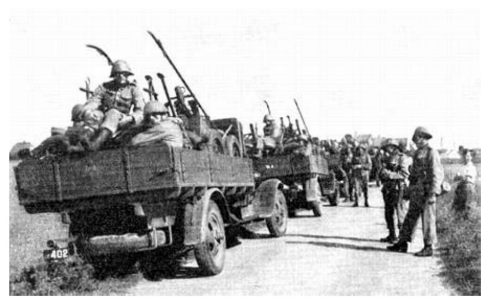
The machine gun division's tank material loaded onto trucks. From Source 5.

Likewise, it is suggested by the functions of the command group that the guard company had motorcycles - possibly a sidecar motorcycle for the commander and/or second-in-command and one or more solo motorcycles for the motor orderlies.