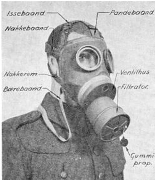
Gas mask M.1931. From Source 8.

To complete the overview of the infantry regiment's vehicles, a number of passenger cars and solo and sidecar motorcycles must be added to the above.