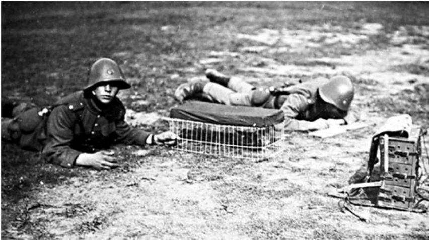
Carrier pigeon service at Fodfolket, approx. 1935 6).

The regimental and battalion carrier pigeons are issued from the division's carrier pigeon division.