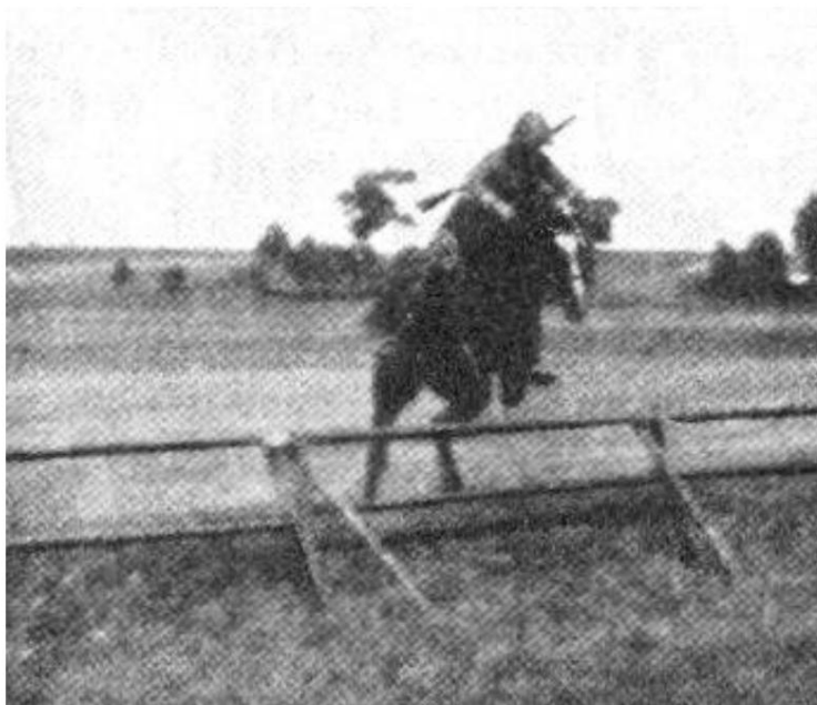
Rider's Ordinance on the way in with a message.

The division is estimated to consist of approx. 20 men.