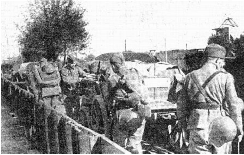
Foot train loaded on railway wagon9).

The pole is equipped with a lamp, with the Geneva cross in the lamp lens.