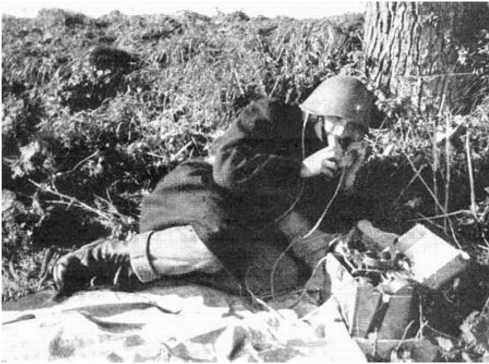
Landline telephone 5 ).

The field telephone is possibly of type E, which was, however, rather used in the artillery than in the infantry.