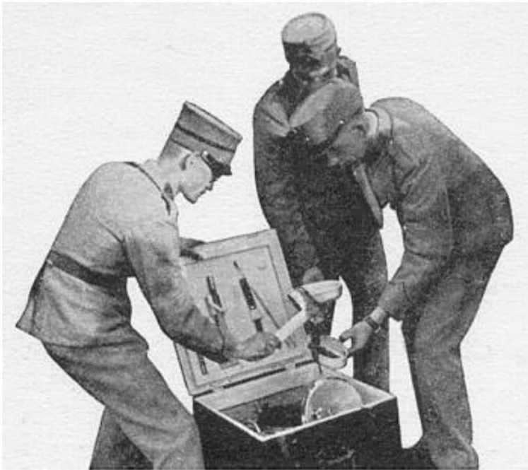
Delivery of dinner from a cooking box.

Bagagevogn I was intended for the regimental commander with actual staff, the commander of the staff company and the liaison platoon, while Bagagevogn II 11 ) was intended for the Luftværnsplatoon, the reconnaissance platoon and the pioneer platoon.