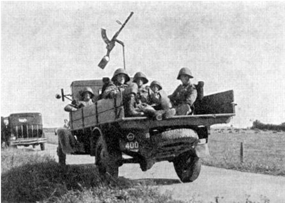
Truck, with machine gun mounted in anti-aircraft pivot. From Source 5.

When "ready for battle" - and shooting from a position on the ground - the material is distributed as follows: