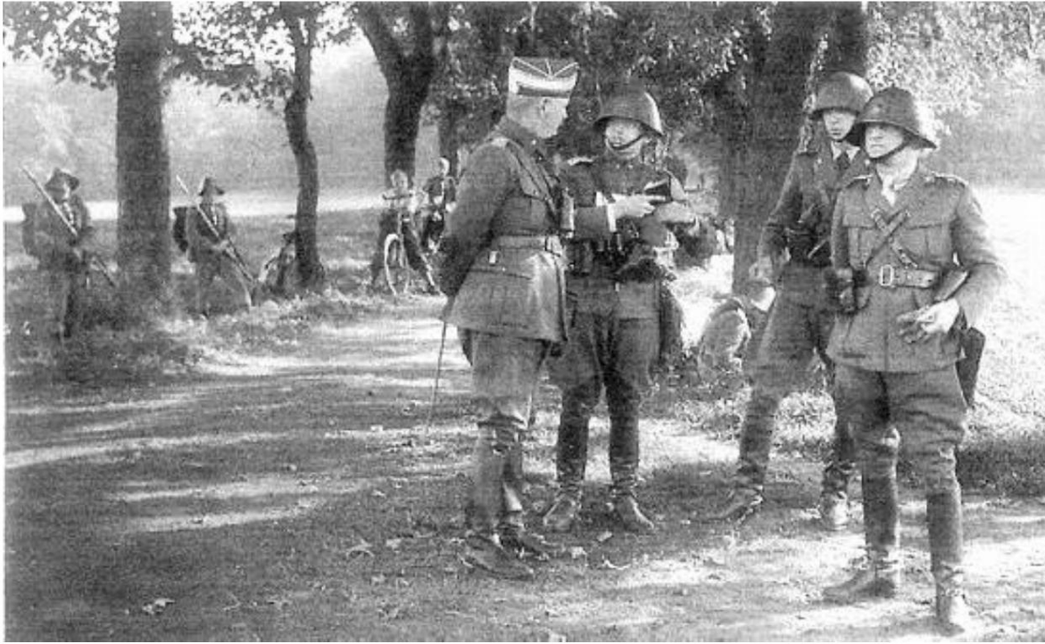
Danish officers, approx. 1938-39 2 ).

The regiment's total combat strength (without reinforcement battalion) is thus approx. 5,000 men 1 ), 375 horses, approx. 250 bicycles, as well as 175 vehicles (horse-drawn vehicles, motor vehicles and motorcycles).