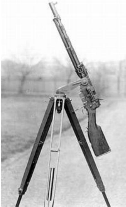
Recoil gun M.1924 in anti-aircraft tripod M.1931. From Source 6.

All who are armed with a rifle or carbine M.1889 are equipped with 40 cartridges, except for the assistant of the anti-aircraft groups and the cyclist groups, who only have 10. However, some of the commanders in the liaison platoon, the cyclist platoon and the pioneer platoon have 20 ordinary 8 mm cartridges as well as 20 armored cartridges.