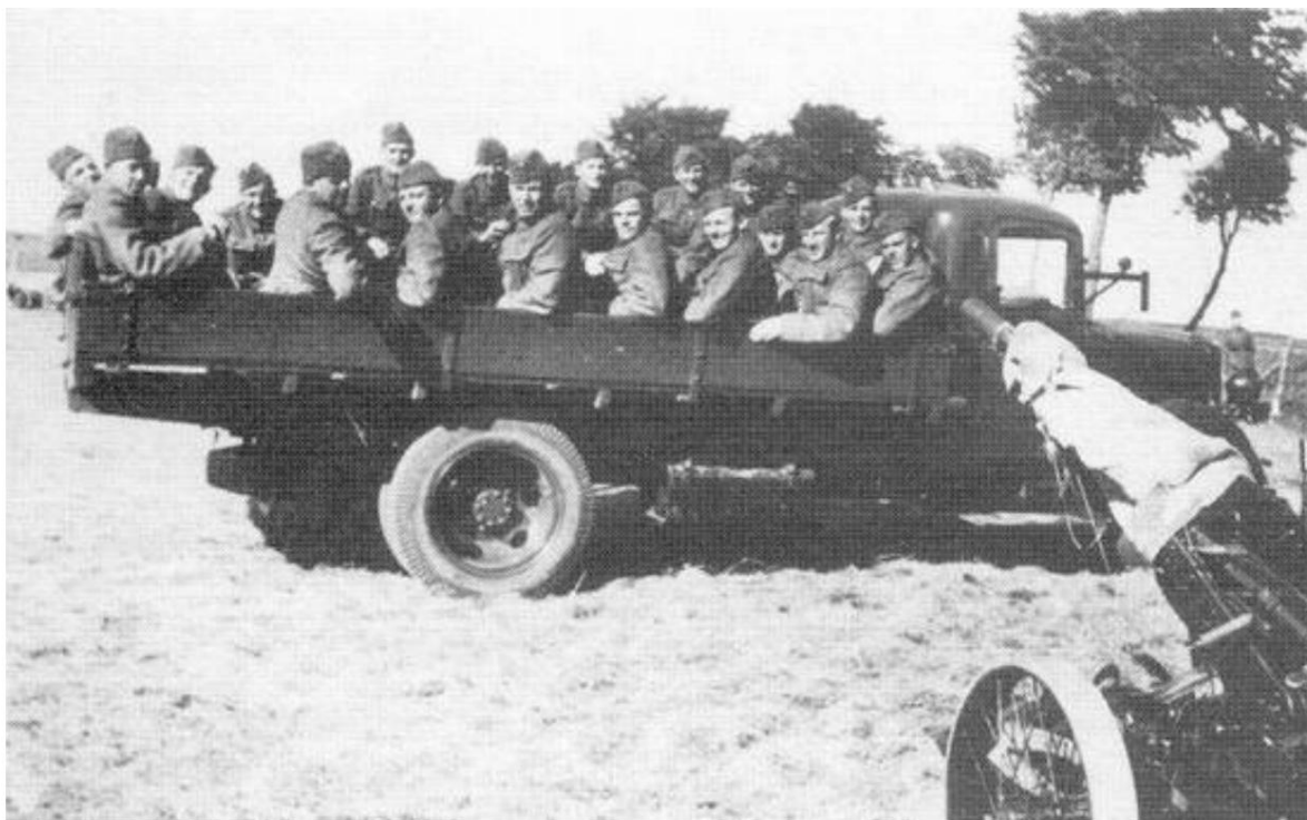
The shooting squadron in Oksbøl.

Dragon Børge Eriksen can be seen in the back seat.