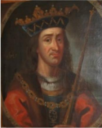
King Hans (b. 1455, 1481 - 1513)

Many have probably learned at school "that the fleet originates from the time of King Hans". That is also true. But before then there had been many different initiatives to establish some form of "sea power" in relation to the royal power. In the years before, the king had his own ships, which were sometimes equipped for war. He could hire merchants, shipowners (shipowners) or skippers to carry out tasks for him, and he could issue letters of privateering to skippers. With such a letter, they became a kind of state-authorized pirates in the waters where the king wanted to demonstrate his power.