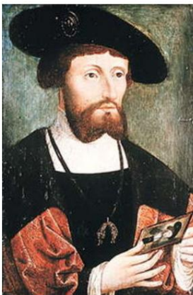
Christian the Second (b. 1481, 1513 – 1523)

"the currents in Our countries are free, and We have no intention, to the detriment of the kingdom and to the benefit of Lübeck, to close them to any seafaring nation."