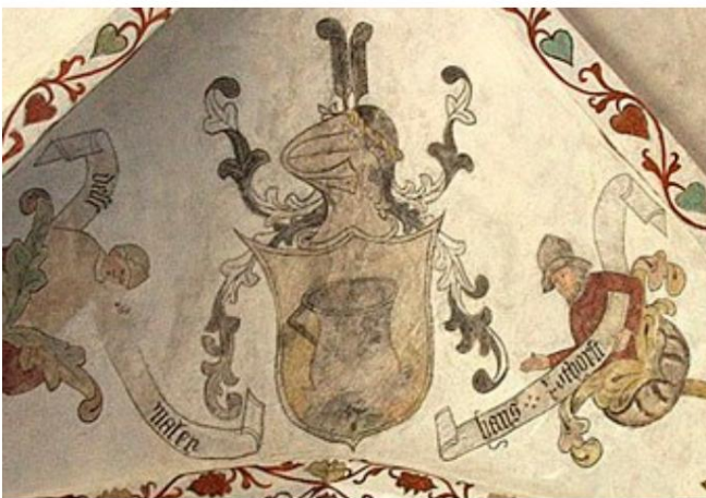
Pothorst is depicted together with his coat of arms, on a fresco in Sankt Maria Kirke in Helsingør.

These were experienced and extremely tough people who were used to operating in waters with enemies and pirates.