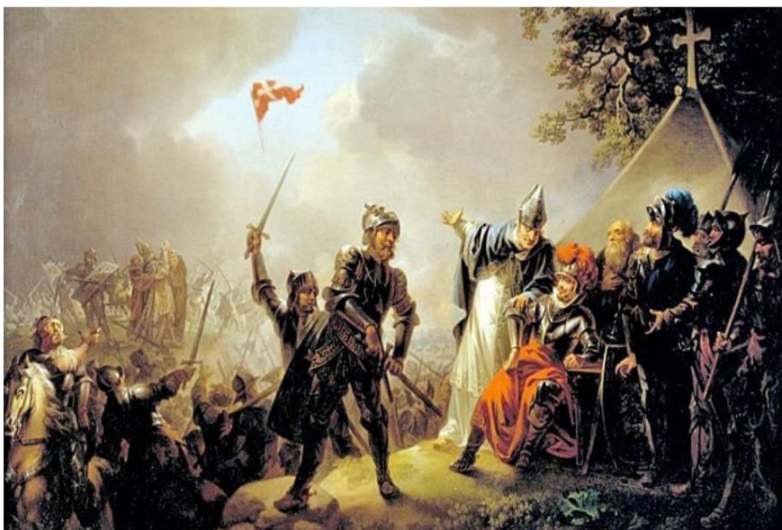
Dannebrog falls to the sky Battle of Lyndanisse 15 June 1219

Later, Valdemar Sejr was able to assemble a large fleet, which in 1219 brought such large forces that the northern part of Estonia could be conquered.