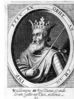
Valdemar Atterdag 1320-1375

This fleet captured Gotland a few years later, which is why the Swedish king Magnus Eriksson had to ask the Hansa[2] for help against the Danes.