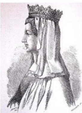
Margrethe d. 1 1353-1412

In 1384, it is Queen Margrethe the First who promises to come to the Hansa's aid against pirates and Denmark provides nine ships.