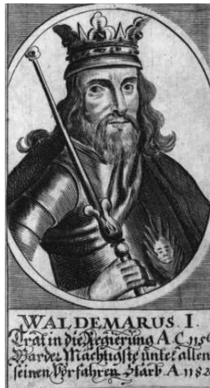
Valdemar the Great 1131-1182

The leadership system was changed under Valdemar the Great and Bishop Absalon, who needed a fleet every spring when the Wends had to be fought. It was then turned into a tax, which had to be paid by those who did not provide ships and crew.