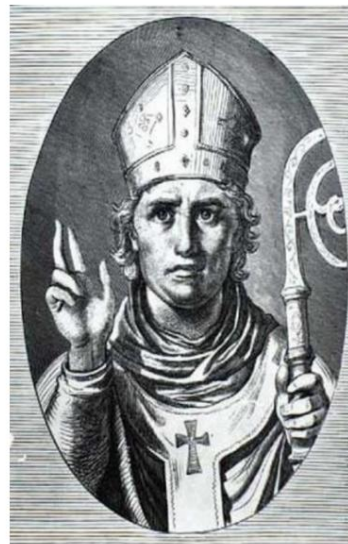
Bishop Absalon 1128-1201

Later, Valdemar Sejr was able to assemble a large fleet, which in 1219 brought such large forces that the northern part of Estonia could be conquered.