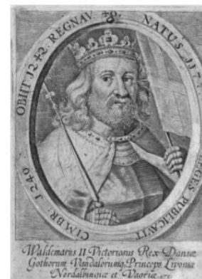
Valdemar Victory 1170-1241