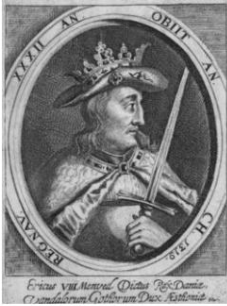
Erik Menved 1274-1319

The management system died out around the year 1300.