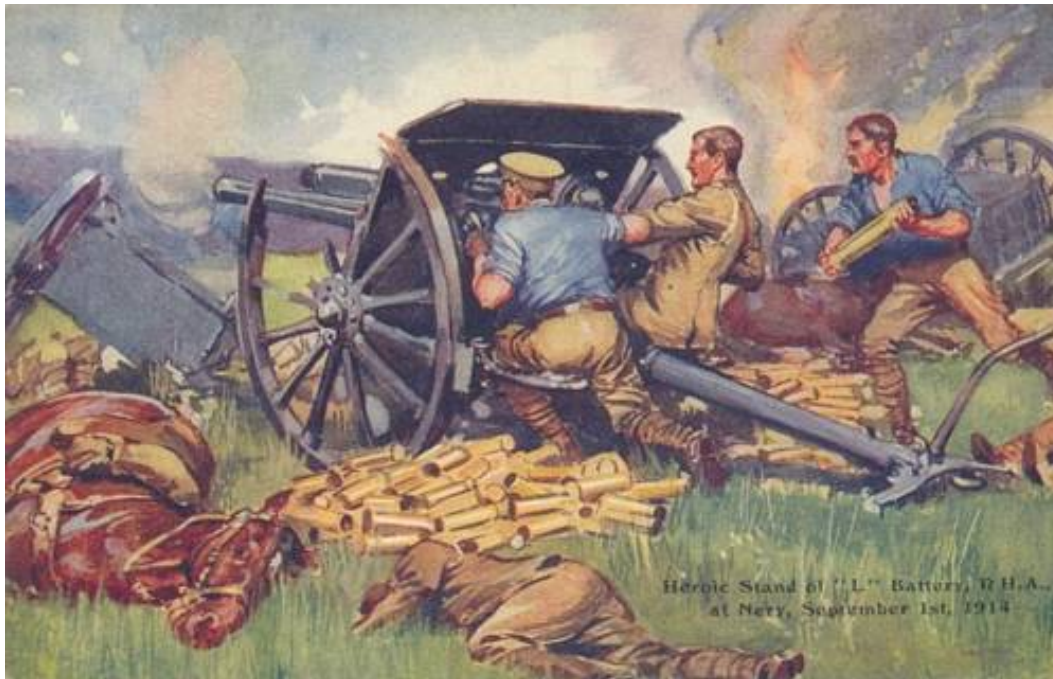
Heroic stand of 'L' Battery, R.H.A. at Néry, September 1 st , 1914.