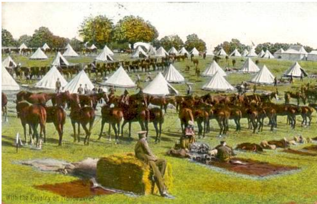
With the Cavalry on Manoeuvres. Coloured postcard, posted 22 January 1909.

'L' Battery on arrival was given a field to the south to bivouac in; and the sugar factory was allotted to it as its headquarters. In the north-west corner of the field were some haystacks.