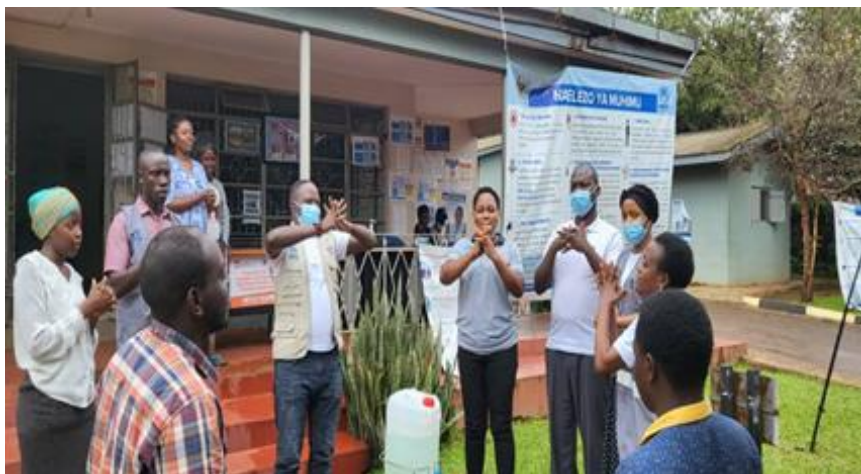
AHA and CAFOMI staff interacting at Kabusu urban-refugee access centre during an Infection and prevention control training.