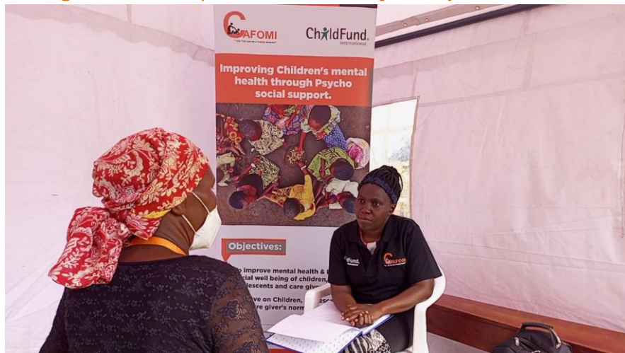
Children and Adolescent Care giver attending an Individual session with the Psychosocial counsellor at Nyakabande Transit centre