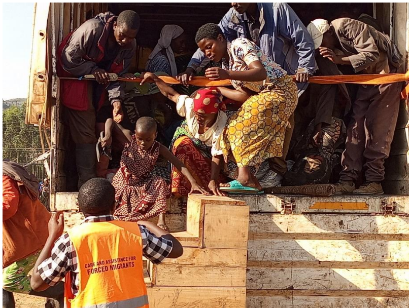
A CAFOMI staff supports a newly arriving refugee child from Democratic Republic of the Congo (DRC) at Nyakabande Transit Centre in Kisoro District.