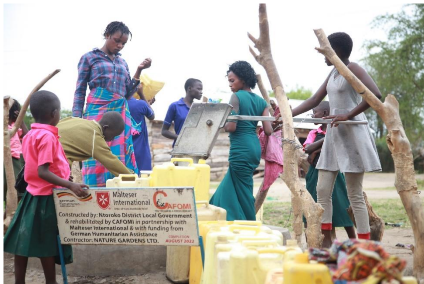
Residents of Kibuku Town Council, Ntoroko District queue up for water from one of the recently rehabilitated bore hole by CAFOMI In partnership with Malteser International with funds from German federal foreign office (AA),