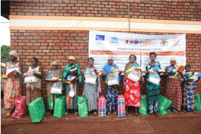
Expectant mothers pose for a photo, shortly after receiving Mama Kit package at Kyangwali Refugee settlement in Kikuube District.