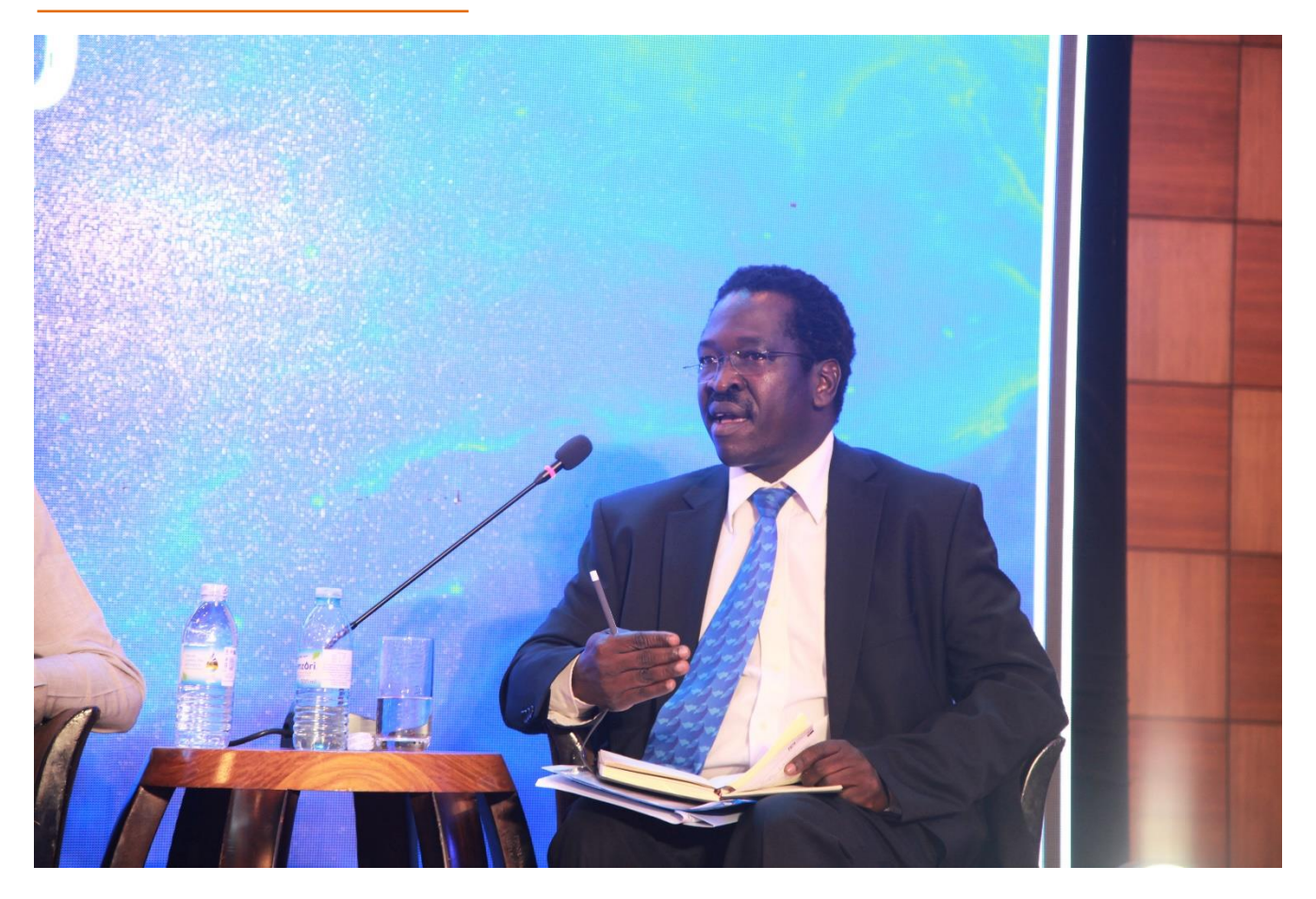
MESSAGE FROM EXECUTIVE DIRECTOR