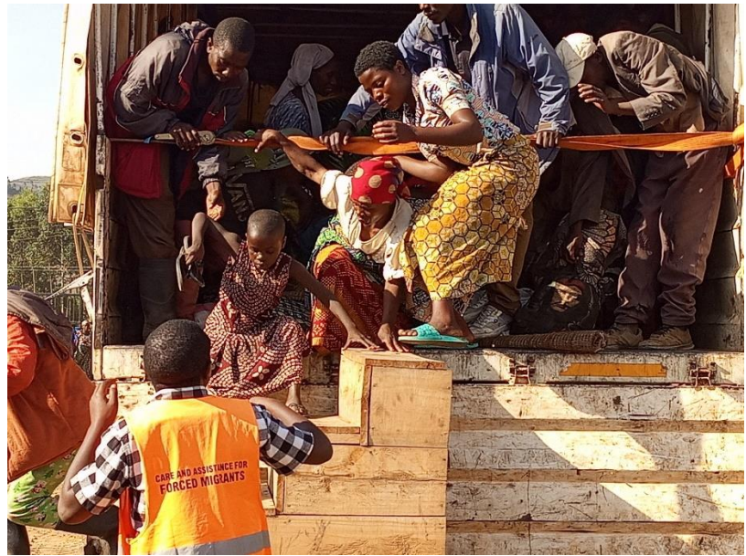
A CAFOMI staff supports a newly arriving refugee child from Democratic Republic of the Congo (DRC) at Nyakabande Transit Centre in Kisoro District.