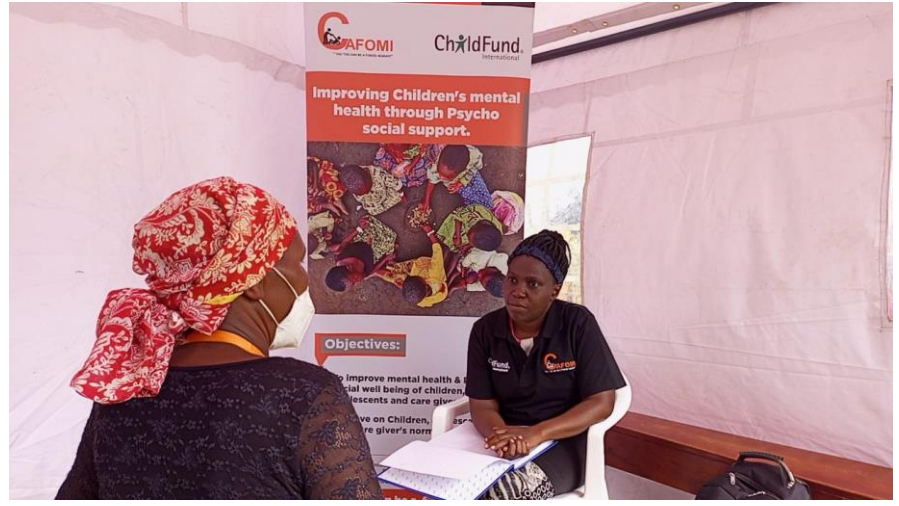
Children and Adolescent Care giver attending an Individual session with the Psychosocial counsellor at Nyakabande Transit centre

Action for the safety of displaced children and their care givers: Nyakabande refugees transit center and Bwera holding centers Kisoro/Kasese districts respectively.