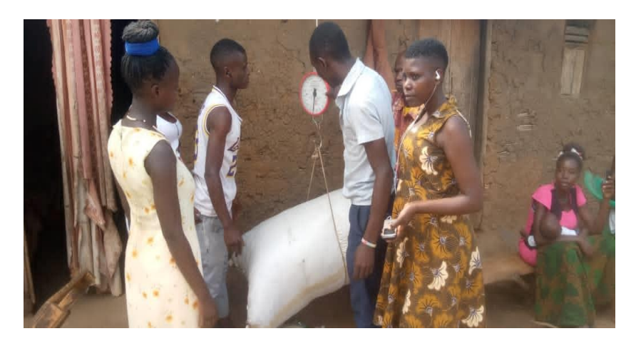
Members of Bundingoma youth livelihood savings group measure cocoa to be taken for sell at the market, cocoa trade is one of the businesses they took up after the training offered to them by CAFOMI with funds from Conrad N. Hilton Foundation.

This project seeks to bridge the gap in livelihood opportunities for the unemployed youth, improve access to quality early childhood education and safe water in the vulnerable communities in Uganda.