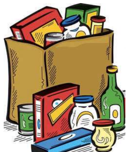
Non-perishable food & toiletries