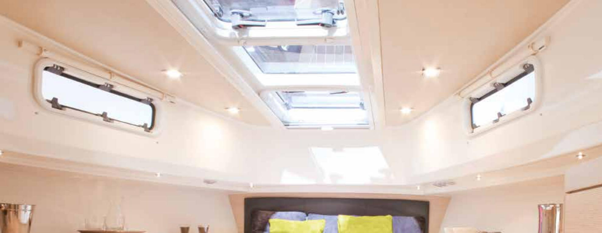
owner cabin with king-size bed