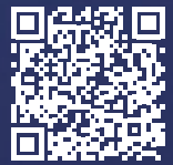
RUT240 360° VIEW