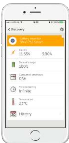
See the VictronConnect BMV app Discovery Sheet for more screenshots