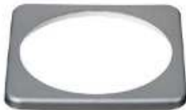
BMV bezel square