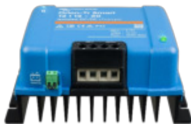
Orion-Tr Smart 12/12-30