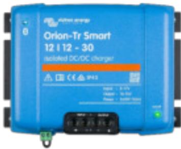
Orion-Tr Smart 12/12-30