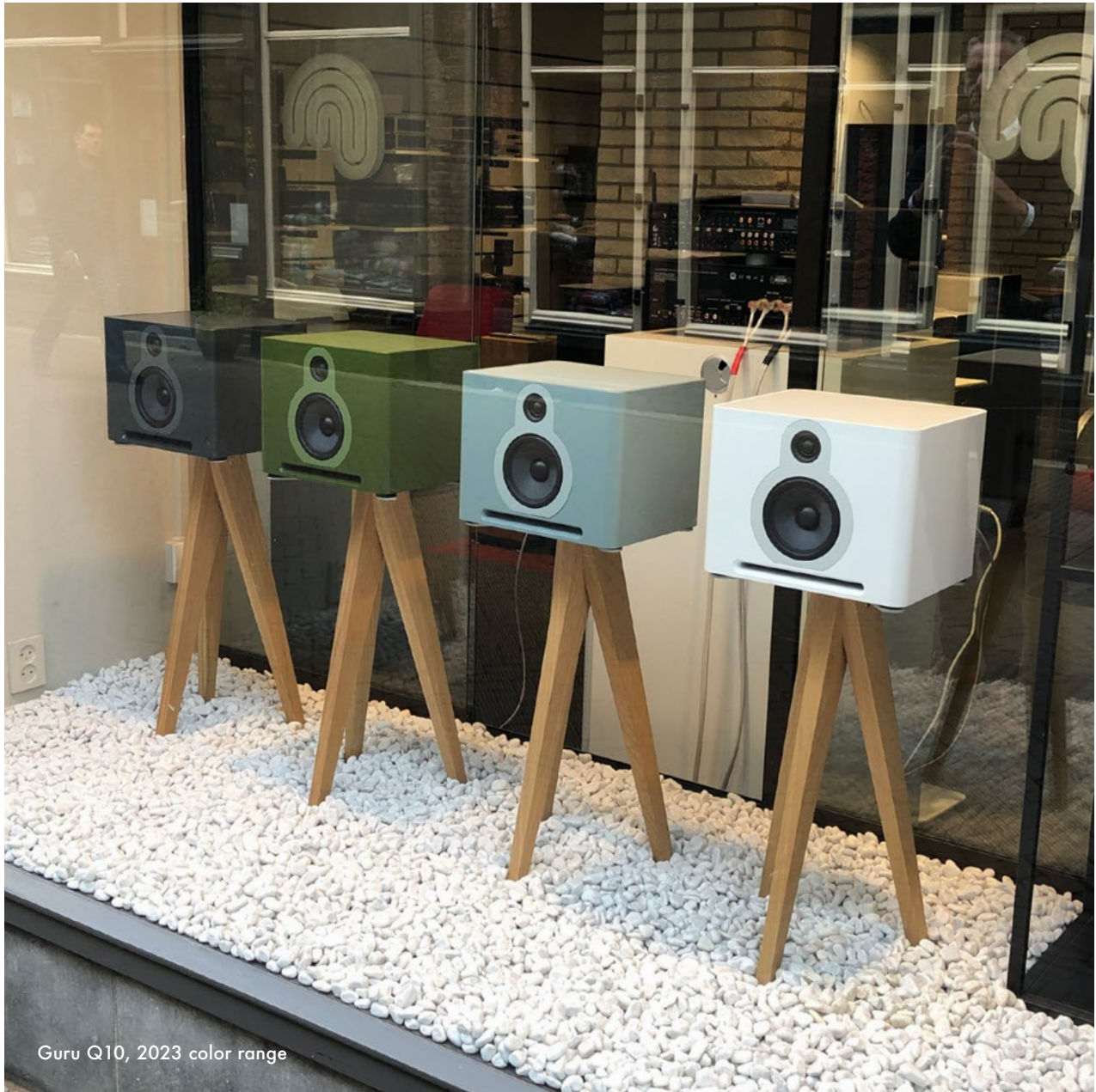
Guru Q10, 2023 color range