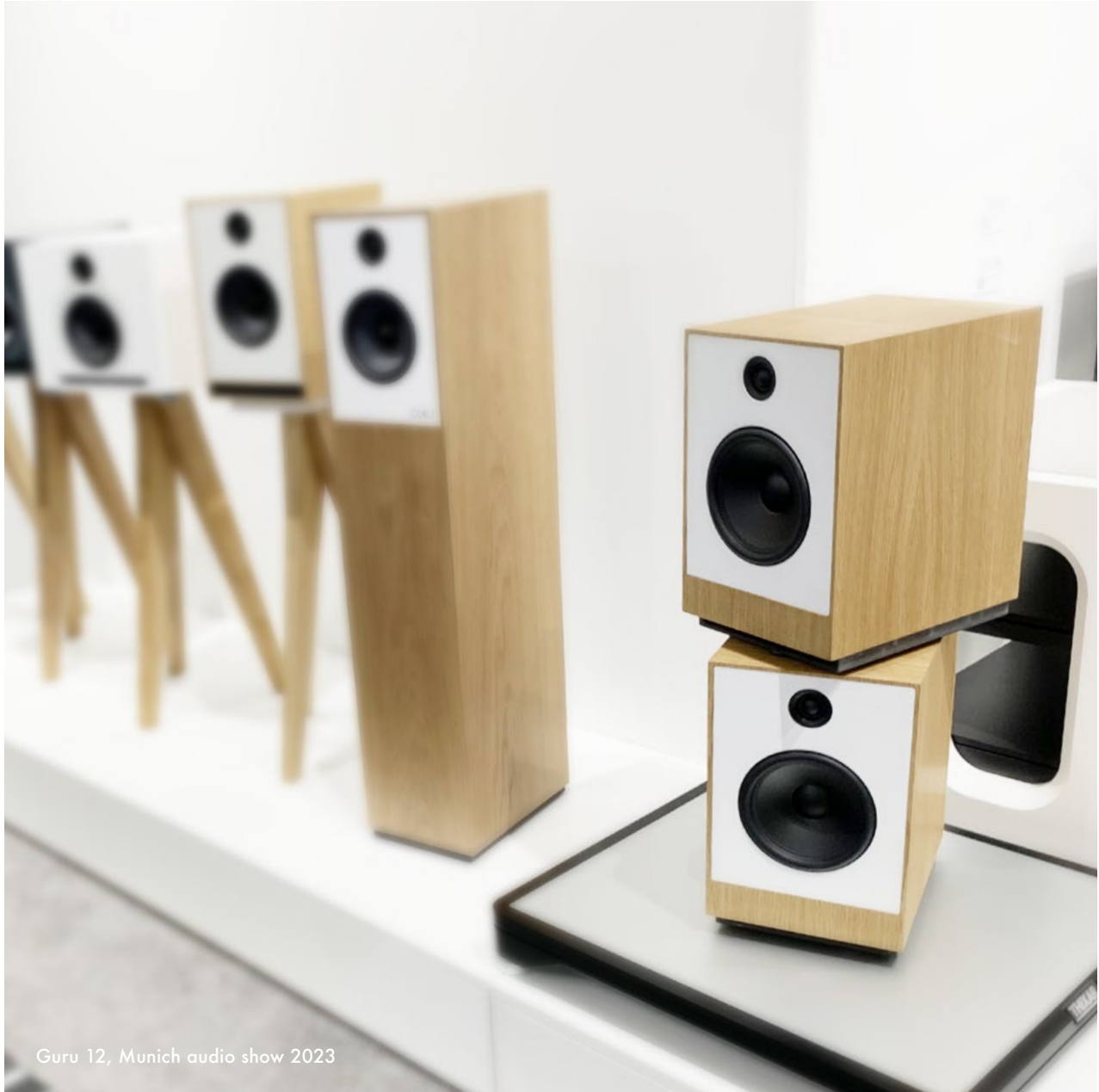
Guru 12, Munich audio show 2023