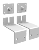
2 galvanized wall mounting brackets