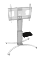
Laptop side shelf