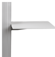
Side shelf for laptop