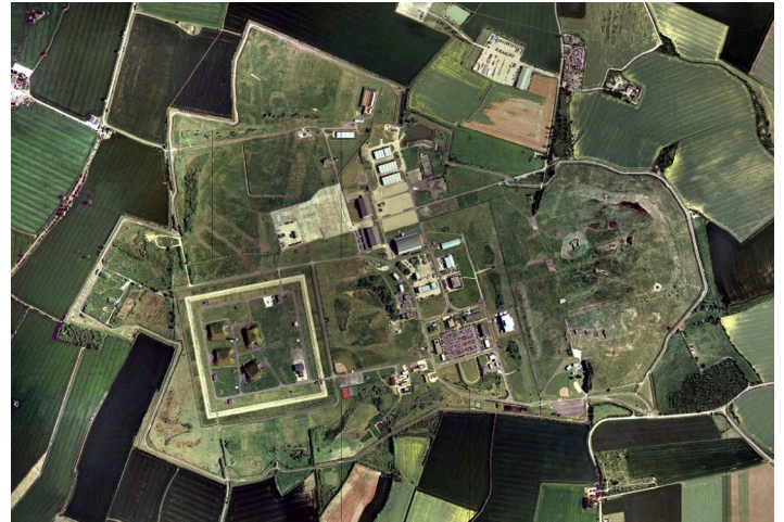
Right - RAF Molesworth

RAF Molesworth, approximately 15 miles west of the Bluntisham opened in 1917. It was active throughout WW2 and later gained prominence with the stationing of ground launched cruise missiles between December 1986 and October 1988.